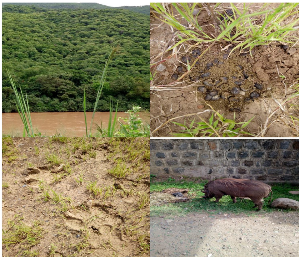
Figure 2. Forest, dung and hoof print of hippo and warthog observed downstream to Ghibe-III dam.

upstream to downstream to the less ecologically disturbed due to less human intervention. On contrary, monkeys, and apes significantly increased and moved into human settlement areas. In Kindo Didaye, which is located downstream from the dam, respondents confirmed there is a significant change in wildlife population, especially following seasonal trends due to natural phenomena and dam construction. During the rainy season when green grass occupies the area, some of the wildlife resumes their original place. Warthog, Hoof print of buffalo and hippo,