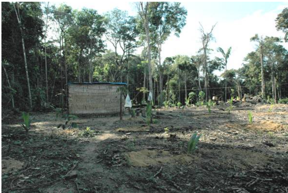
Fig. 4. Settlers within the Biological Dynamics of Forest Fragments Project (BDFFP) study area have illegally cut native forest. Theft, hunting, and intentional fires have also posed problems to the BDFFP. This photograph depicts one settlement in July 2007.

The possible demise of the BDFFP, a research site that spans three decades, would be a great scientific and educational loss. Approximately three decades of research have been conducted at the BDFFP, yet the BDFFP has also been a source of employment and educational opportunities ( e.g. , training in science and management) for local residents, for Brazilians from other areas of the country, and for the international community [7, 46]. Past and present BDFFP researchers have also partnered with other agencies to work with the rural population on agroforestry projects ( e.g. , education, training, distribution of native seedlings), and to provide educational materials on how to make a living without disturbing the protected areas (R. Luizão, pers. comm.). Scientists also credit the cooperation between the local landowners and the BDFFP researchers for the success of the BDFFP project [45]. Therefore, increased human colonization of the study area threatens all aspects of the BDFFP, including the conservation of the primates in the area.