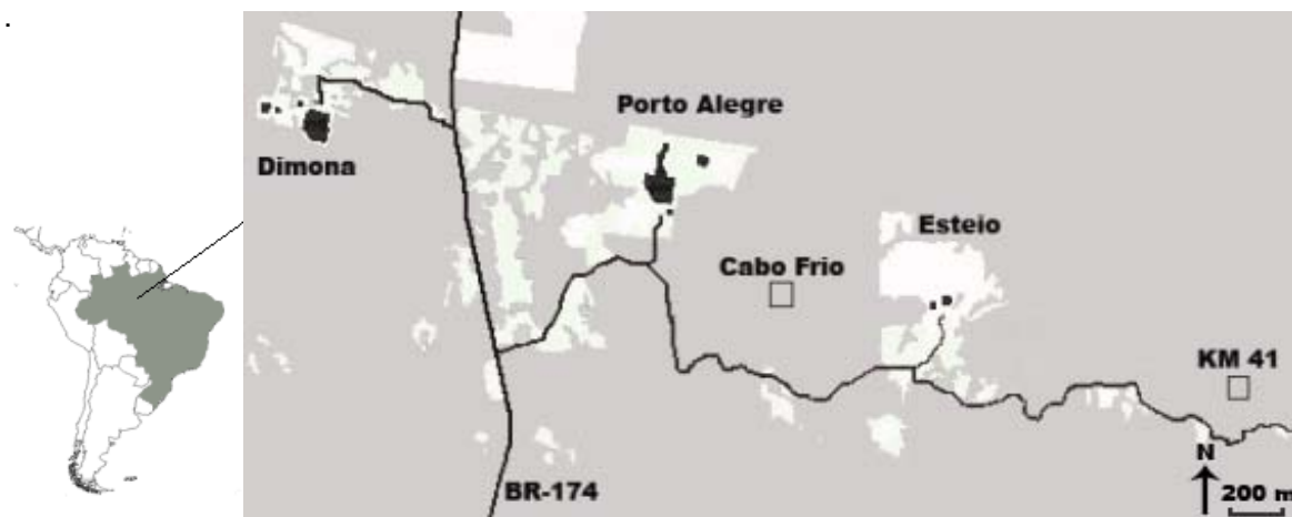
Fig. 3. The Biological Dynamics of Forest Fragments Project (BDFFP) is located approximately 80 km north of Manaus, the capital of the state of Amazonas. Forest fragments are located throughout three cattle ranches, or fazendas , Dimona, Porto Alegre, and Esteio. Cabo Frio and Km 41 are two continuous forest sites. Fragments are black, clear-cut areas and secondary forest areas are white, and old growth forest is gray. The SUFRAMA colonization plan would settle families within the area of BDFFP

Six primate species reside in the BDFFP study area: red howler monkey ( Alouatta seniculus ), black spider monkey ( Ateles paniscus ), brown capuchin monkey ( Cebus apella ), brown bearded saki ( Chiropotes satanas chiropotes ) 1 , white-faced saki monkey ( Pithecia pithecia ), and golden-handed tamarin ( Saguinus midas ). Although research at BDFFP has been ongoing since 1979, primate research in the forest fragments has been sporadic, with in-depth behavioral and ecological research only on red howler monkeys [35-40], white-faced saki monkeys [41-43], and bearded saki monkeys [44]. Therefore, there is still much to learn regarding the responses of the primates to forest fragmentation.