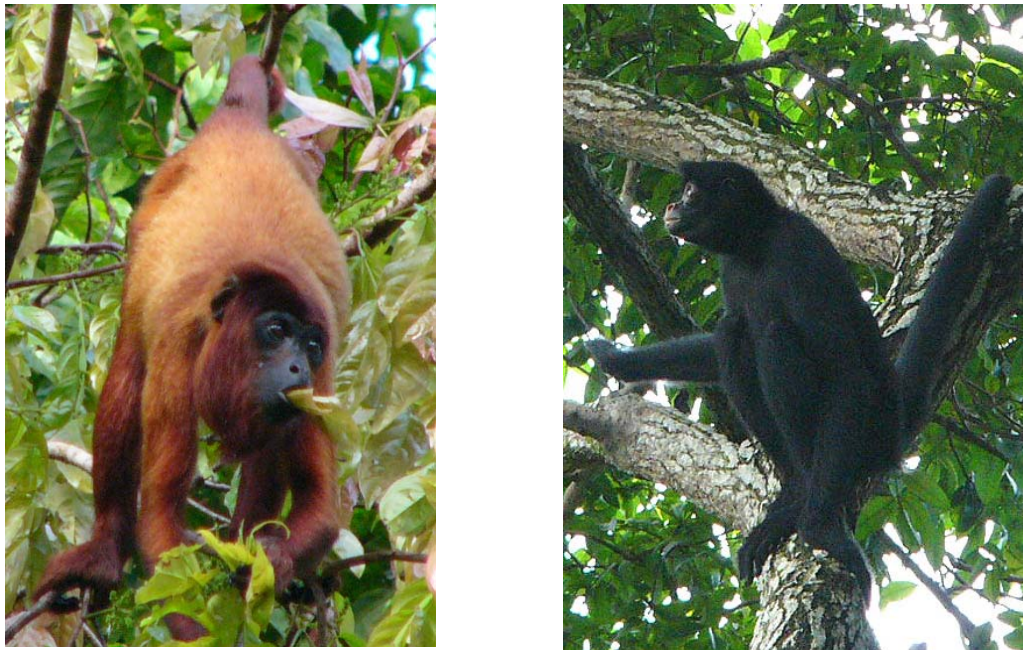
Fig. 5. Red Howler monkeys ( Alouatta seniculus ) are more prevalent in forest fragments than the other five primate species at BDFFP. They are commonly found in fragments as small as 10 ha, and intermittently reside in fragments as small as 1 ha. Black spider monkeys ( Ateles paniscus ) have been the least prevalent primate species in the forest fragments at BDFFP. These large-bodied frugivores often face intense hunting pressure throughout the Amazon.

There is serious conservation concern for the future of the BDFFP primates, in particular those that are virtually absent from the majority of the forest fragments ( i.e. , black spider monkeys, brown capuchin monkeys), those that appear to be severely isolated from other groups due to their hesitance to cross a young matrix ( i.e. , bearded saki monkeys), and those that may be currently under hunting pressure in the immediate areas surrounding the BDFFP reserves ( i.e. , black spider monkeys, red howler monkeys, and brown capuchin monkeys).