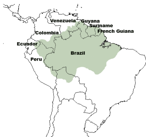
Fig. 1. The Amazon Basin in South America is comprised of areas of Brazil, Bolivia, Peru, Ecuador, Colombia, Venezuela, Guyana, Suriname, and French Guiana. Approximately 4,100,000 square kilometers (50%) of the forested area is located in Brazil

One of the consequences of deforestation is forest fragmentation, an ever-increasing global phenomenon affecting the persistence of healthy forest ecosystems across the planet [9]. Forest fragmentation occurs when sections of contiguous forest are cleared, thereby leaving a mosaic of patches surrounded by a non-forested matrix. As deforestation for agriculture or urban development continues, the remaining forest becomes increasingly patchy, affecting local climate [10, 11], species richness and distribution [10, 12, 13], predator-prey interactions [14], seed dispersal [15, 16], and habitat suitability [17, 18].