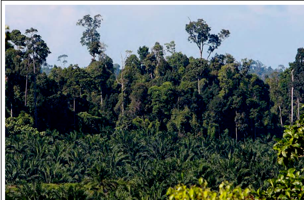
Fig. 4. Oil palm plantation adjacent to tropical forest in Sabah, Malaysia.