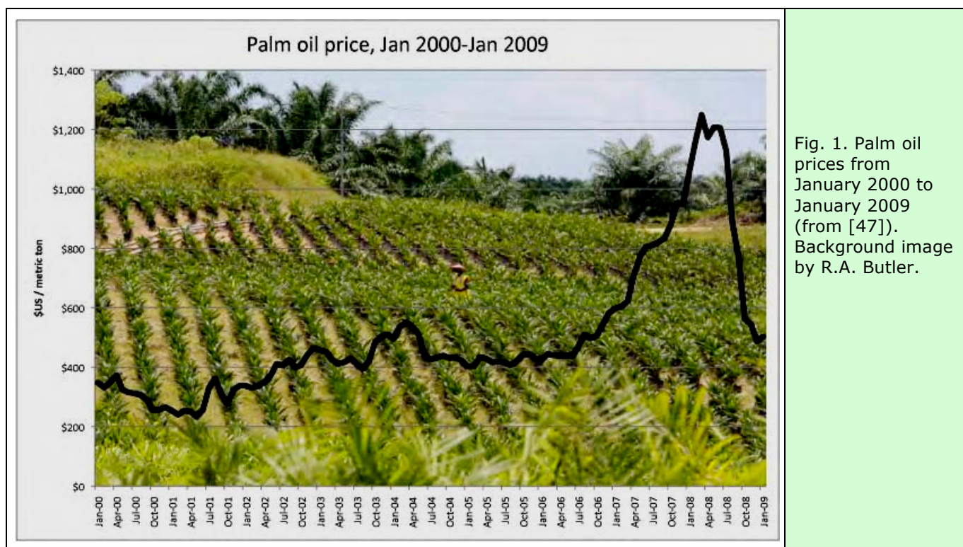
Fig. 1. Palm oil prices from January 2000 to January 2009 (from [47]).

Yet few realize that oil palm could soon drive similar forest loss in Amazonia, the world's largest expanse of tropical forest. Here we briefly describe the confluence of factors that could promote a sharp increase in oil palm agriculture in the region. Although the crop is being established in various parts of Latin America, we focus here on Brazil, where geographical, political, and corporate forces appear particularly aligned to pursue the aggressive expansion of an oil palm industry. We argue that, contrary to prevailing public discourse in Brazil, oil palm expansion would constitute a serious threat to Amazonian ecosystems and their associated biodiversity.