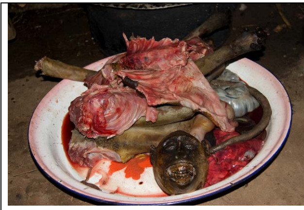
Fig. 3. Sykes monkey on the menu. Photo by M.R. Nielsen taken in one of the villages surrounding NDUFR.

Elephants, buffaloes, lions, and hyenas were recorded only in WKSFR. Medium-sized species (>16 kg) such as bush pig, Abbott's duiker, and aardvark were significantly less abundant in both hunted areas. Smaller ground-living species had the lowest relative density in the area with the highest level of hunting, while two of three primate species were approximately equally abundant in the two hunted areas. To protect the astounding biodiversity of WKSFR, the Ndundulu, and Nyanbanitu forests and the adjacent Matundu and Iyondo forest reserves have recently been gazetted as the Kilombero Nature Reserve [62]. The status as nature reserve is the highest protection under the Tanzanian Forestry and Beekeeping Division legislation, equivalent to the National Park status of the Tanzania National Parks Authority.