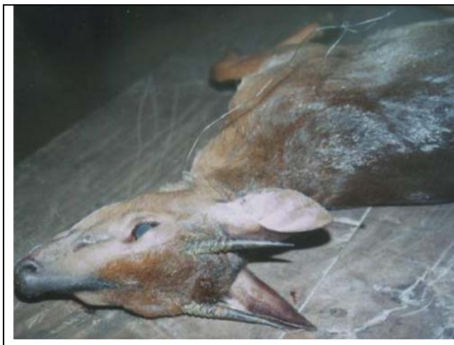
Fig. 4. Suni ( Neotragus moschatus ) caught with a cable snare. taken in one of the villages surrounding NDUFR.