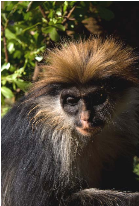
Fig. 1. Udzungwa red colobus ( Procolobus gordonorum ) endemic to the Udzungwa Mountains. Photo by M.R. Nielsen taken in NDUFR.

The Eastern Arc forests of Kenya and Tanzania have, as a component of the Eastern Afrotropical biodiversity hotspot, been ranked among the 34 most biologically diverse areas in the world [4]. The Udzungwa Mountains have the largest area of forest cover within the Eastern Arc and have been considered of particular importance for the protection of biodiversity [5, 6]. Despite the now fragmented nature of forested areas, the Udzungwa Mountains support populations of five mammal species and two subspecies that are endemic to the Eastern Afro-Montane and the Coastal Forests biodiversity hotspot [4] as well as 12 IUCN threatened listed larger mammals (>400 g). A considerable number of new vertebrate species have also been discovered in recent years (see [6]). The larger endemic mammal species in the Udzungwa Mountains include Abbott's duiker ( Cephalophus spadix ), the newly discovered grey-faced sengi or elephant shrew ( Rhynchocyon udzungwensis ) [7], and three endemic primates: Udzungwa red colobus ( Procolobus gordonorum ) (Fig. 1), Sanje mangabey ( Cercocebus galeritus sanjei ), and the kipunji ( Rungwecebus kipunji ), a newly described genus [8]. It is assumed that forest cover was continuous in recent historical time [5]. Previous logging and agricultural encroachment has fragmented the forests (median natural forest patch area 8.74 km 2 , [9]), reduced available habitats, and led to the threatened status of many of these species.