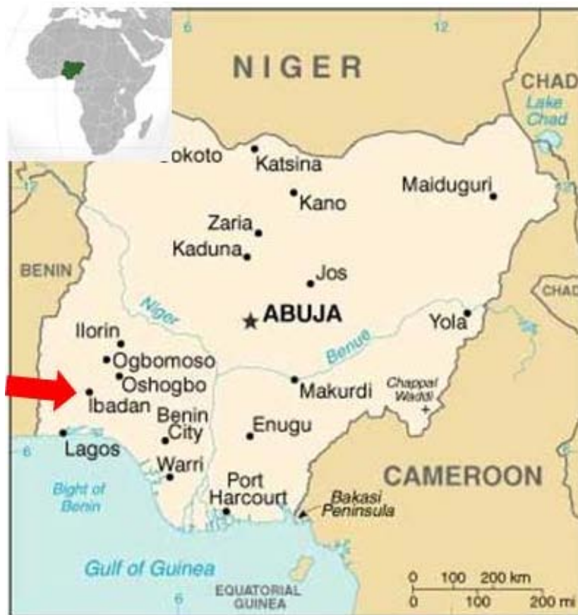
Fig. 1: Map of Nigeria showing the location of the study area, located in Ibadan (red arrow).

The field gene bank of the National Centre for Genetic Resources and Biotechnology (NACGRAB) is a protected area earmarked for the conservation of forest trees, fruit, oil, roots, and tuber crops and all other plants whose seeds are recalcitrant and cannot be successfully stored in cold seed gene banks. It is about 12 hectares wide, located within latitude 7^{\circ} 22' north of the equator and longitude 3^{\circ} 50' east of the Greenwich Meridian (Fig. 1)