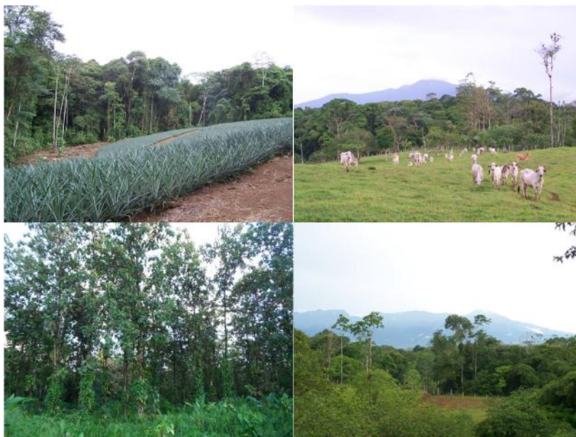
Fig. 2. Four representative matrix land-use types within the San Juan – La Selva Biological Corridor. From left to right: pineapple plantation, cattle ranch, tree plantation, eco-lodge reserve.