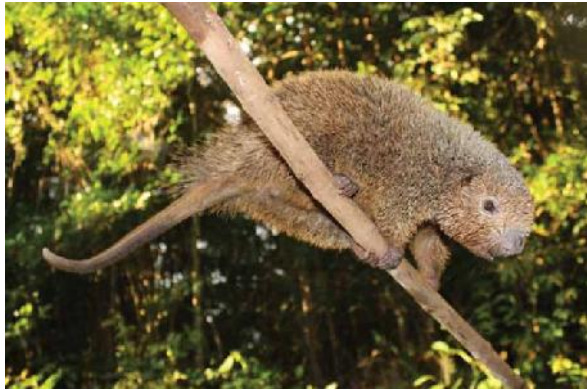
Fig. 1. The thin-spined porcupine, Chaetomys subspinosus.

dwarf porcupine and treated as such, but the extent of this fact (and its consequences) is unknown. We also based our initial planning on some common assumptions about human-wildlife interactions, such as the existence of a correlation between socio-demographic background and knowledge. Since the species is a potential target for hunting, hunters should have more ecological knowledge about the thin-spined porcupine than other people. The ultimate goal of this study is to strengthen strategies for protected area management and for the species' conservation.