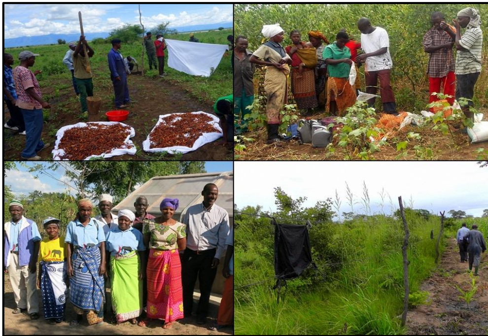
Fig. 1. Chili fences and community-based organizations (CBOs): (top left) a farmer-to-farmer exchange demonstrates chili fences construction; (top right) chili fences are made of locally available and inexpensive materials; (bottom left) the Mikumi Tembo-Pilipili team in front of Africa’s first solar chili-dryer made of local materials; (bottom right) a Mikumi chili fences protecting maize and chili crops.

Between 2006 and 2015, over 800 farmers in high HEC areas worked with the Tembo-Pilipili (Kiswahili for ‘elephant-chili pepper’) program to construct 110 chili fences of different sizes encompassing roughly 1,174 ha of maize ( Zea mays ), sorghum ( Sorghum bicolor ), and watermelon ( Citrullus lanatus ) fields. In 2015 alone, approximately 70 ha of crops were fenced along the Mikumi National Park border and 65 ha along the northwest border of Tarangire National Park. The Mikumi Tembo-Pilipili team introduced chili fences to farmers around Tarangire National Park in 2015, with one new CBO. A Tembo-Pilipili team was established and multiple fences were constructed.