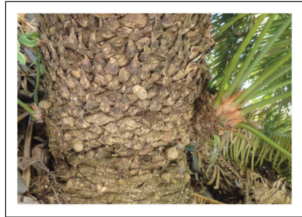
Figure 1. The Pachycaulous C. micronesica Stem Produces Adventitious Buds That Develop Into Adventitious Stems. These side stems can be removed for asexual propagation.

The general appearance of the available adventitious stems was as shown in Figure 1. The range in size was similar for the three species. Length of the cuttings ranged from 5 to 8 cm, and number of leaves per cutting ranged from 2 to 6. All leaves were removed at the base