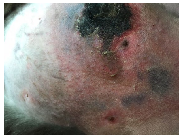
Figure 2 Case 2: this image depicts the necrotic eschar which became apparent on day 5

discomfort. There were also multiple small raised nodules surrounding the central necrotic area, and crusting papules and nodules around the head and neck (Figure 3). Buprenorphine was administered (Vetergesic [Ceva] 20 µg/kg IV q8h) to provide analgesia.