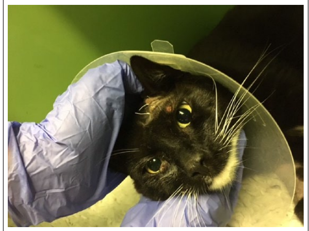
Figure 3 Case 2: this image depicts the lesions noted on the head, which are typical of cowpox virus dermatopathy. As some of these had been biopsied prior to the photograph having been taken, there are sutures present

The cat re-presented on day 12, with its appetite having reduced, resulting in difficulty administering oral medications. The cat was lethargic again. The cat was given intravenous rFeIFN-ω (as above) for a further 3 days. However, by day 14, de novo nodular lesions had developed on the neck, head and thoracic limbs. The ventrally necrotic region began expanding in size and the small raised papules were becoming more evident