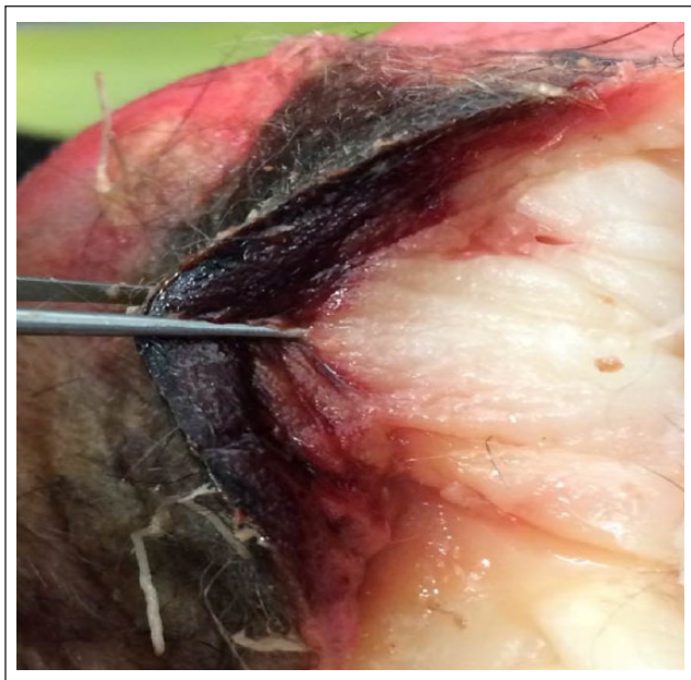
Figure 4 Case 2: image obtained post mortem demonstrating the full extent of the eschar, extending the entire layer of the dermis