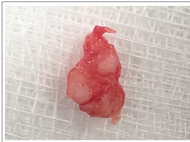
Figure 2 Photograph of the resected fragmented sesamoid

puncture wound on the palmar aspect of the distal metacarpal region. Radiographs were performed of the right and left manus; however, no abnormalities were identified. The lameness was initially managed with a 4-week course of meloxicam (0.05 mg/kg q24h PO) and a one-off injection of cefovecin (8 mg/kg SC), in conjunction with restricted exercise. There was minimal improvement noted over the 4 weeks prior to referral.