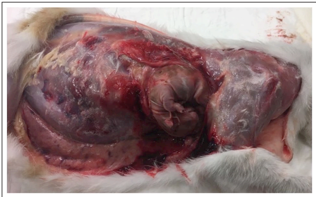
Figure 2 Post-mortem photograph of the right lateral thoracic and abdominal wall with the skin removed as part of the necropsy examination of a female domestic shorthair cat, euthanized after having been hit by a car. Dissection of thoracic subcutaneous tissues revealed a herniated fetus, ecchymosis and mild hemorrhage

Necropsy was initiated by extending a small, full-thickness cutaneous laceration on the right lateral thoracic wall. The first fetus was immediately present in the subcutaneous space over right ventrolateral thorax (Figure 2). Dissection was continued cranially through the subcutaneous tissues along the lateral aspect of the thorax to expose a second extraluminal fetus, the head of which was entrapped in the brachial plexus. The abdominal musculature was avulsed at its insertion on the ribs with partial herniation of small intestines. Within the peritoneal cavity, the right uterine horn was torn in half