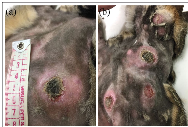
Figure 1 (a) A single nodular lesion, 3 cm in diameter, localised on the medial surface of the left thigh, presenting with a scab on the top. (b) Round, nodular lesions, localised in the region of the thorax and abdomen. The cat was first subjected to hair removal, which highlighted the hyperaemic aspect of skin

Nearly a month after the skin nodule eruption, the cat was presented for clinical evaluation and pharmacological treatment. Corticosteroids improved the patient's