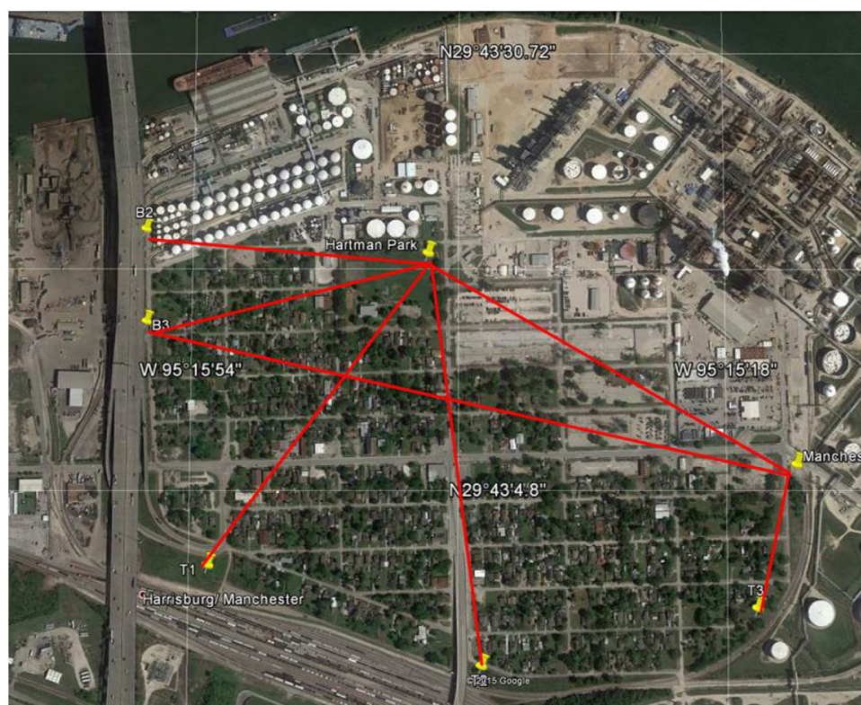
Figure 2. Tomographic network configuration in the Manchester neighborhood of Houston during the BEE-TEX study.

To complement the area-wide CAT scans, three mobile laboratories equipped with real-time instrumentation were deployed by Aerodyne, HARC, and UH within the BEE-TEX study area. Each mobile laboratory carried a proton transfer reaction-mass spectrometer 13 (PTR-MS), which is a type of CIMS instrument, in addition to a global positioning system and a portable weather station. The main air toxics monitored by PTR-MS were BTEX compounds and styrene. The Aerodyne mobile laboratory 14 was equipped with additional devices, including a QCL, and an alternative NO + ion source for the PTR-MS, which normally uses hydronium (H 3 O + ) as a reagent ion. The former made it possible to conduct real-time measurements of formaldehyde (HCHO), which normally cannot be measured by PTR-MS without substantial drying of air samples, 15 while the latter enabled