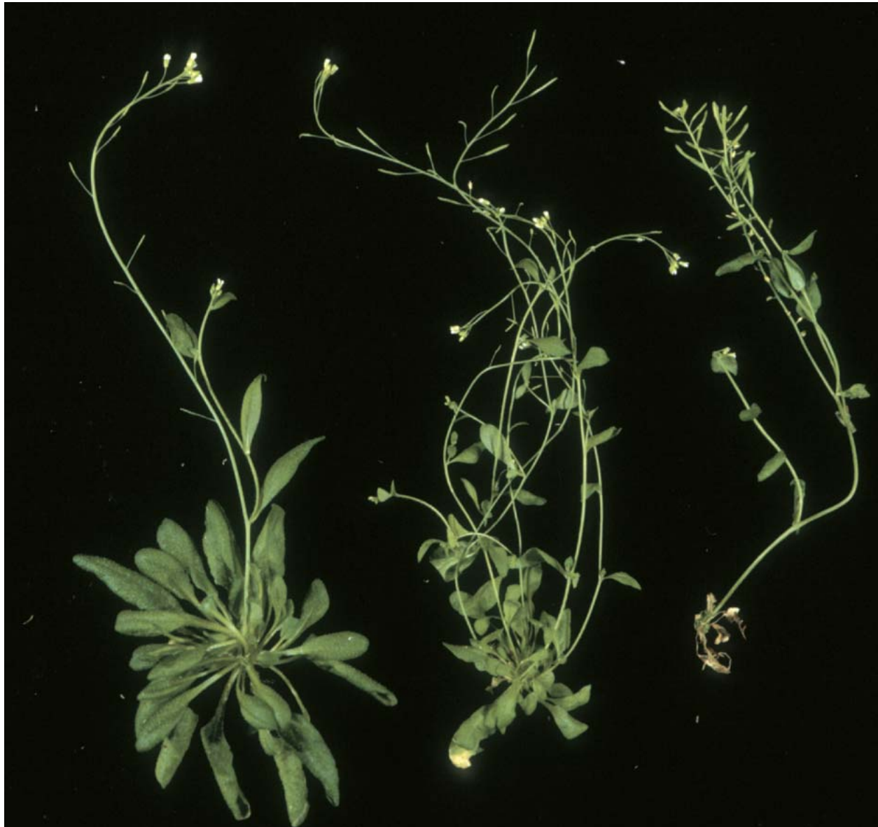
Figure 1. Systemic infection of Xcc2D520 in differential Arabidopsis accessions. Select basal leaves (3-5) of 3-4 week old plants were infiltrated with Xcc2D520 ( \sim 10^7 CFU ml -1 ). Photographs were taken 23 d.p.i. The accessions from left to right are Col-0, Pr-0, and Ler.

Xanthomonas isolate. This avirulence gene, avrXca , was isolated from X. c. raphani and confers incompatibility in a large number of Arabidopsis accessions (Parker et al. , 1993). avrXca encodes a large protein (~67 kDa) that is possibly secreted from the bacterium and the upstream region of avrXca contains a putative hrp box suggesting avrXca is controlled by the hrp regulatory system. The hrp pathway is an essential component of pathogenicity and