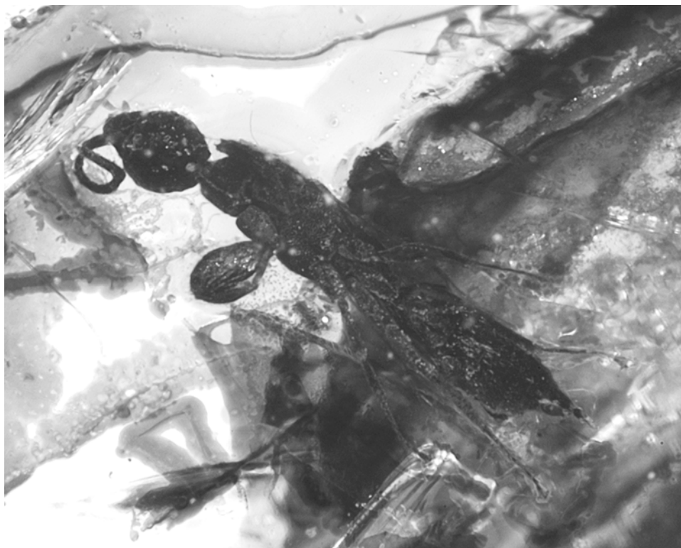
Fig. 1. Photomicrograph of holotype female of Sclerogibbodes embioleia (AMNH), new genus and species.

doubtedly present in the earliest Cretaceous as well. The exploration of amber deposits throughout the world is imperative for additional material of this family. The hosts of sclerogibbids (i.e., Embiodea) are similarly rare in the fossil record. Webspinner fossils have been recovered from the mid-Cretaceous amber of Myanmar (Cockerell, 1919; Davis, 1939; Grimaldi et al., 2002; Engel and Grimaldi, 2006), Eocene Baltic amber (e.g., Ross, 1956), Miocene Dominican amber (Szumik, 1994, 1998), as well as a compression fossil from the Eocene-Oligocene boundary of Florissant, Colorado (Cockerell, 1908; Ross, 1984). As discussed elsewhere the mid-Cretaceous Embiodea are not basal members of the order and the origin and radiation of the group must have been significantly earlier (Grimaldi et al., 2002; Engel and Grimaldi, 2006). The embiodeans in Burmese amber have swollen probasitarsi, indicating that the mid-Cretaceous is a minimal age for the habit of constructing silken galleries. In lieu of