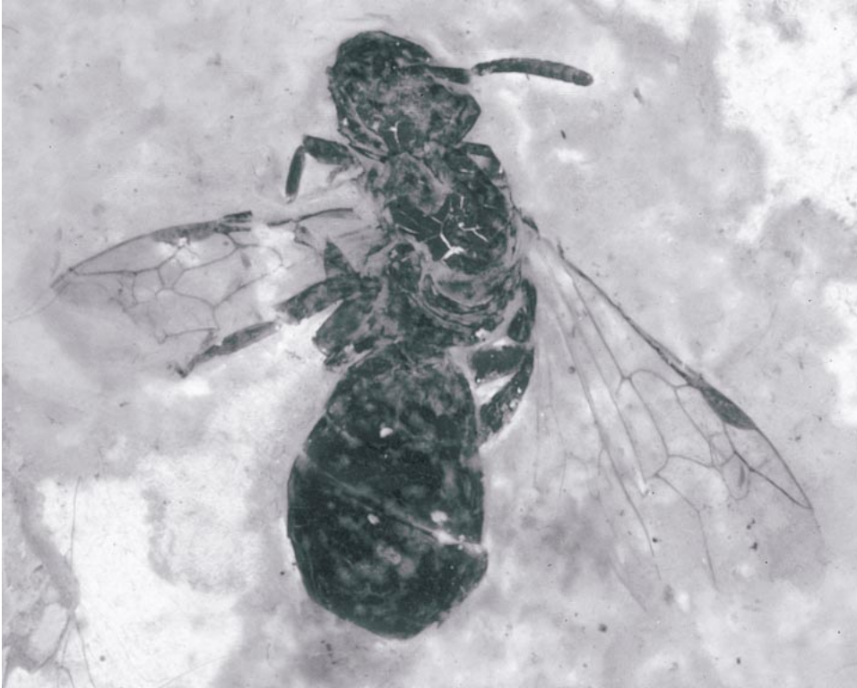
Fig. 2. Photomicrograph of holotype of Halictus petrefactus , new species (MPZ-98/423). Total length of specimen = 8.2 mm.

times vein width (i.e., 1m-cu and 2m-cu [recurrent veins] enter separate submarginal cells); 2rs-m arcuate; pterostigma elongate, length about three times width, border inside marginal cell convex; apex of marginal cell acute, minutely separated from wing margin; first submarginal cell elongate, nearly as long as combined lengths of second and third submarginal cells; second submarginal cell shorter than third submarginal cell, trapezoidal shape, posterior and anterior borders not parallel, posterior border diverging apically toward 1m-cu, anterior border slightly shorter than that of anterior border of third submarginal cell; third submarginal cell with posterior border nearly 1.5 times length of anterior border. Hind wing as depicted in figure 3; only a few hamuli observable (three just distad separation of R, two near termination of costa). Wing veins black, membrane hyaline. Legs black except tarsi (where preserved and evident) apparently dark brown; metafemoral scopa present (setae