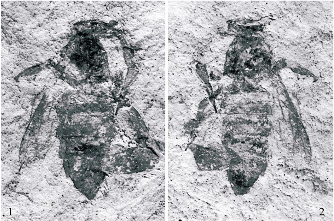
Figs. 1–2. Photomicrographs of Apis lithohermaea n.sp., holotype. 1. Part. 2. Counterpart.

rows, bristle rows, or pollen brush rows) ( A. dorsata , with its longer metabasitarsus, has 12–14 postauricular pectens; this species is intriguing in that it combines a relatively elongate metabasitarsus with the plesiomorphic condition of fewer pectens; 8–9 pectens is the usual condition for species of the mellifera and florea groups). Metasomal segments typical for bees of the dorsata group in observable characters (e.g., proportions of segments).