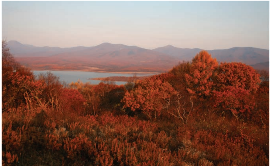
This autumn landscape shows the Sikhote-Alin Biosphere Zapovednik (reserve) on the coast of the Sea of Japan. The brackish lake, called Blogadotna, which loosely translates as “thankful place,” harbored a small fishing village in the 1950s but is now fully protected under Russia’s zapovednik system. The area is prime habitat for red and sika deer and, thus, for tigers.

Despite the drop in Russia’s wild tiger numbers, proponents of an Amur tiger reintroduction in Central Asia believe the effort is an important step. It would allow for restoration of the tigers’ natural range, they say, and hedge against the risk of extinction facing all small populations from factors such as disease. The tigers also may come from captive-bred Amur tigers. With behavioral training to hunt in the wild, some biologists believe, Amur tigers in zoos around the world offer