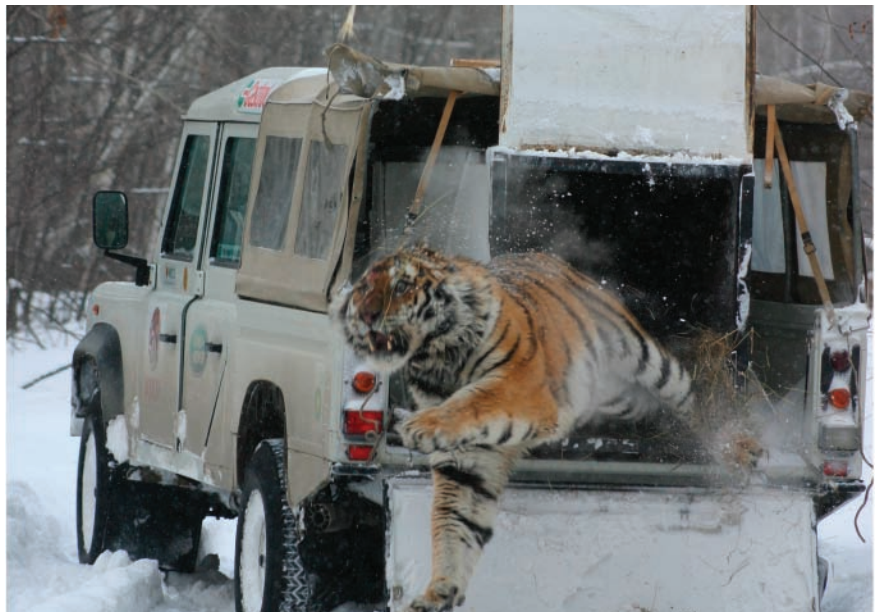
A wild Amur tiger bursts from a cage after being rescued from a poacher’s snare by personnel from the Wildlife Conservation Society and Russia’s Inspection Tiger. The tiger was found by field workers conducting a survey of tiger prey species. Aside from minor abrasions from the snare cable, the tiger was unharmed.

another source for translocation. Is the seemingly impossible—returning tigers to Central Asia—in fact possible?