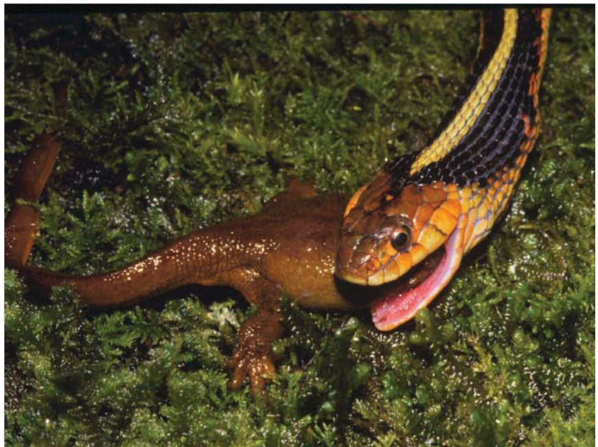
An adult garter snake (Thamnophis sirtalis) makes a meal of a toxic newt (Taricha granulosa).