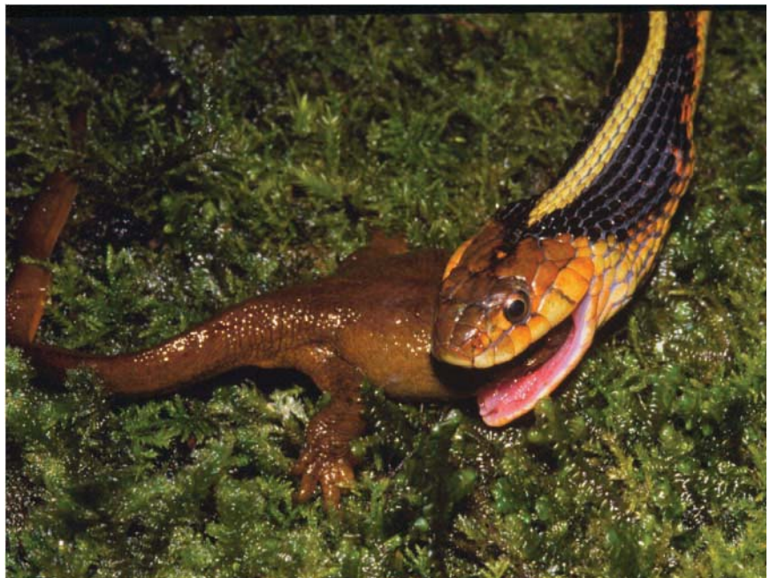
An adult garter snake (Thamnophis sirtalis) makes a meal of a toxic newt (Taricha granulosa).