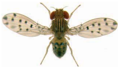
Drosophila guttifer differs from other fruit flies in that it has black spots and gray patches on each wing. Micrograph: Nicolas Gompel and Sean Carroll.

such as limbs, evolved independently through different genetic mechanisms. Now we know that the Distal-less gene is involved in the formation of all sorts of appendages across the animal kingdom.