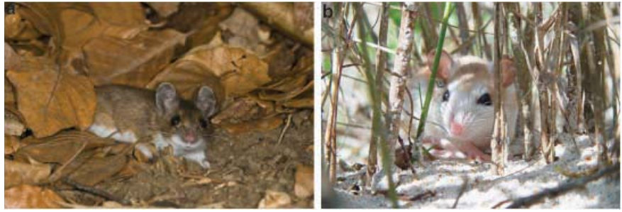
Dark, mainland oldfield mice such as the mouse on the left ( Peromyscus polionotus subgriseus ) are found in populations across the southeastern United States. Light beach mice ( Peromyscus polionotus phasma , right) blend into their native habitat on the Atlantic coast of Florida.

Many organisms use color for advertisement—for example, in mate choice, in mimicry, and as a warning. Oldfield mice exhibit extreme color variation among populations in the southeastern United States for a different reason: camouflage. Mice inhabiting inland, agricultural areas have dark brown coats to match the dark soil, but when some of them migrated to coastal dunes, their coloration evolved to a lighter color, allowing them to blend into the white sandy beaches. To determine the benefit of coloration for survival, Hoekstra's team placed