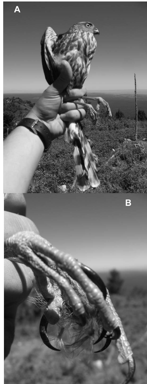
FIGURE 1. (A) A hatch-year Sharp-shinned Hawk captured at Capilla Peak in the Manzano Mountains, New Mexico, with distended crop, indicating recent prey capture and consumption. (B) Close-up of feet of the same bird, showing feathers of prey stuck to toes and talons.

Other researchers sampled potential avian prey in the area at two sites, one near the raptor-banding site at Capilla Peak (DeLong et al. 2005) and the other 35 km north of Capilla Peak in the foothills of the Manzanita Mountains near Coyote Springs. The mist-netting site at Capilla Peak was ~1 km from the primary raptor-banding site along the same ridge complex used by migrating raptors. Migrating raptors frequently passed through the netting area, hunted in the vicinity, and were occasionally captured in the mist nets. The Coyote Springs mist-netting site was in the same mountain range as Capilla Peak, with raptors known to pass through the area before arriving at Capilla Peak. Thus prey sampled