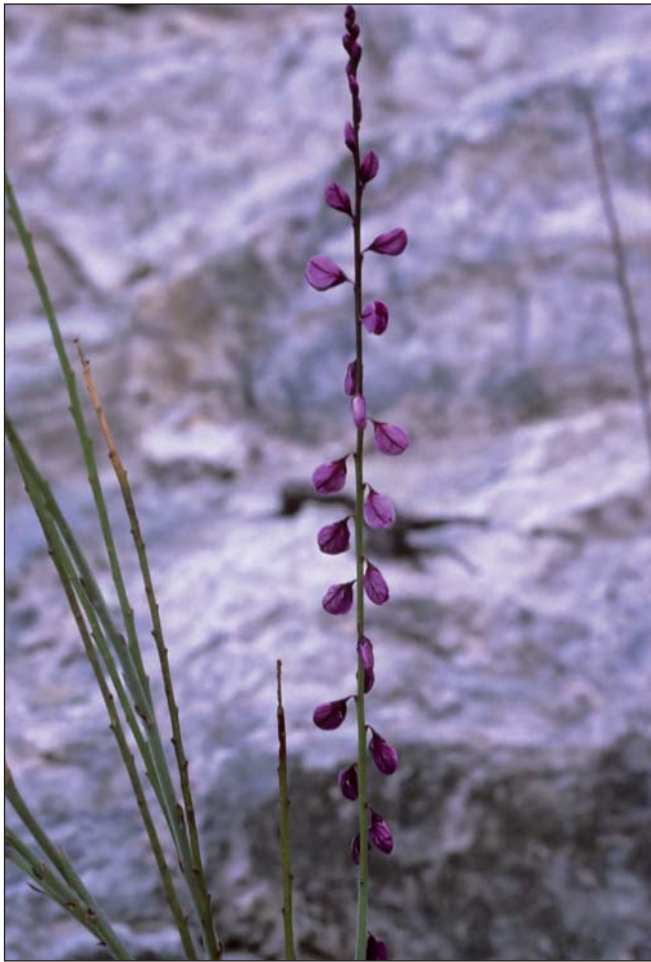
Fig. 2. – Living plant of Polygala retamoides (H. Perrier) Wahlenk., G. E. Schatz & Phillipson, growing in its natural habitat on the marble outcrops south of Ambatofinandrahana. [Labat & al. 2370]

Occurrence and Area of Occupancy of no more than a 10 km 2 in an area that is under considerable human pressure from fire and mining; Polygala retamoides is therefore assigned a preliminary conservation status of “Critically Endangered” [CR B 1ab(i,ii,iii,v)+2ab(i,ii,iii,v)]. It is interesting to note that other species also appear to be endemic to the marble outcrops near Ambatofinandrahana but are not known from elsewhere in the Itremo Complex, for example Buxus cipolinica Lowry & G. E. Schatz (LOWRY & SCHATZ, 2006), suggesting the importance of this area to be brought into the protected area network of Madagascar.