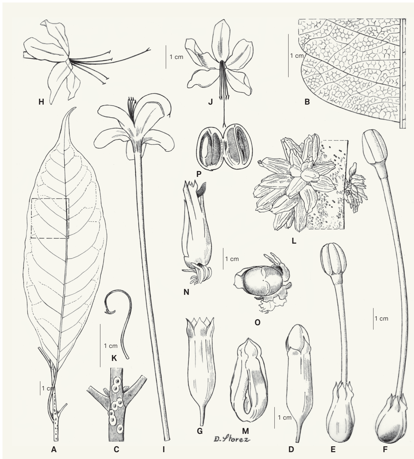
Fig. 1. – Line drawings of Clerodendrum kamhyoae Phillipson & Allorge. A. Leaf showing long attenuate-acuminate apex and arcuate secondary veins; B. Detail of secondary and tertiary leaf venation; C. Stem node showing lenticelles; D. Early flower bud with the corolla pushing open the sepals; E. Young flower bud with elongating corolla tube; F. Pre-anthesis flower bud; G. Mature calyx; H. Corolla seen from side (tube incomplete); I. Corolla seen from below; J. Corolla seen from front; K. Stamen with mobile anther thecae; L. Young inflorescences; M. Calyx surrounding an immature drupe showing an irregular split due to the expansion of the ovary; N. Part of infructescence, with calyx enveloping immature fruit and pedicels of fallen flowers visible; O. Fruit with calyx removed to show the upper surface of the drupe; P. Longitudinal section of the ovary showing the two locules. [A-K: Allorge 2839, P; L-P: redrawn from photographs] [Drawings: D. Storez]