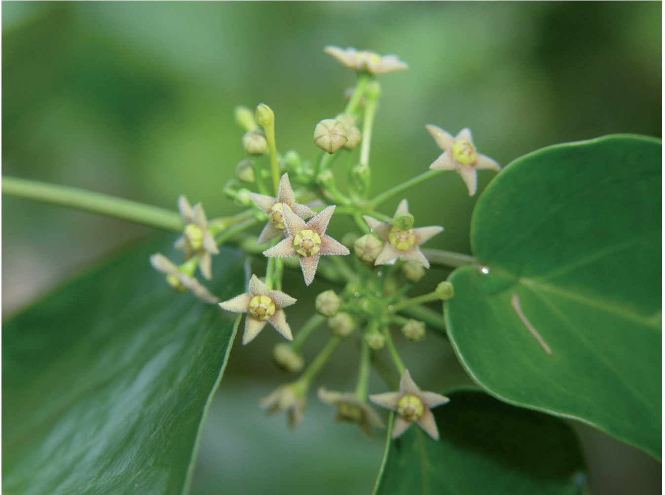
Fig. 3. – Field pictures of the new species Tylophora mayottae W.D. Stevens, Labat & Barthelat.

Conservation status. – Marsdenia mayottae is only known from highly threatened littoral and lowland dry forests on Mayotte, and its population, as currently known, is highly fragmented. It is only known from five locations despite intensive inventories in the last decades. Thus, its preliminary risk of extinction can be assessed as “Endangered” [EN B2ab(iii)] following the IUCN Red List Categories and Criteria (IUCN, 2012).