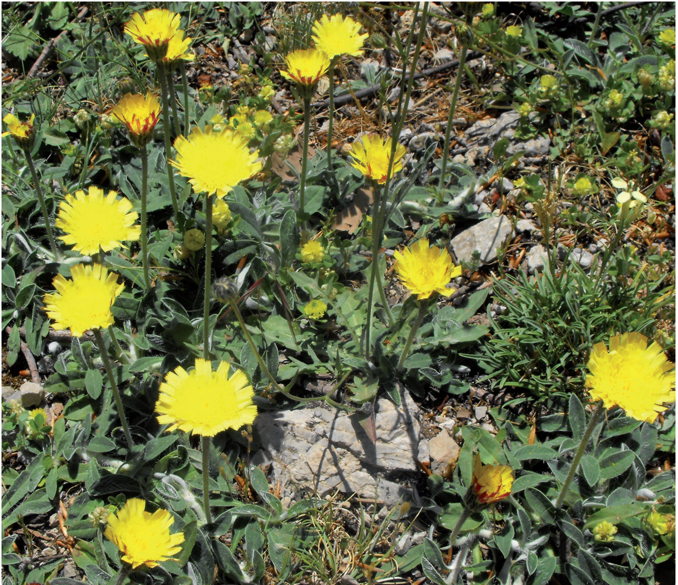
Fig. 2. – Blooming populations of Pilosella hoppeana subsp. sicula Di Grist., Gottschl. & Raimondo in Mt. Scalone (Madonie mountains).

(-25) cm high, green, beneath with sparse to moderately dense, 1-4(-6) mm long, simple hairs, sparse, 0.2-0.3 mm long, glandular hairs and moderately dense stellate hairs, above with sparse or no, 0.4-1.5 mm long, simple hairs, moderately to rather dense, 0.2-1.1(-1.4) mm long, glandular hairs and dense stellate hairs. Rosette-leaves 3-5(-7), green, petiolate; lamina oblanceolate-spathulate, 3.5-5.5 × 0.7-1.3 cm, entire, obtuse, rounded or acute, attenuate, above with moderately to rather dense, 3-5 mm long, simple hairs, beneath with dense stellate hairs and moderately to rather dense, 3-6 mm long, simple hairs, mostly along the midrib and the petiole. Cauline-leaves 0-1