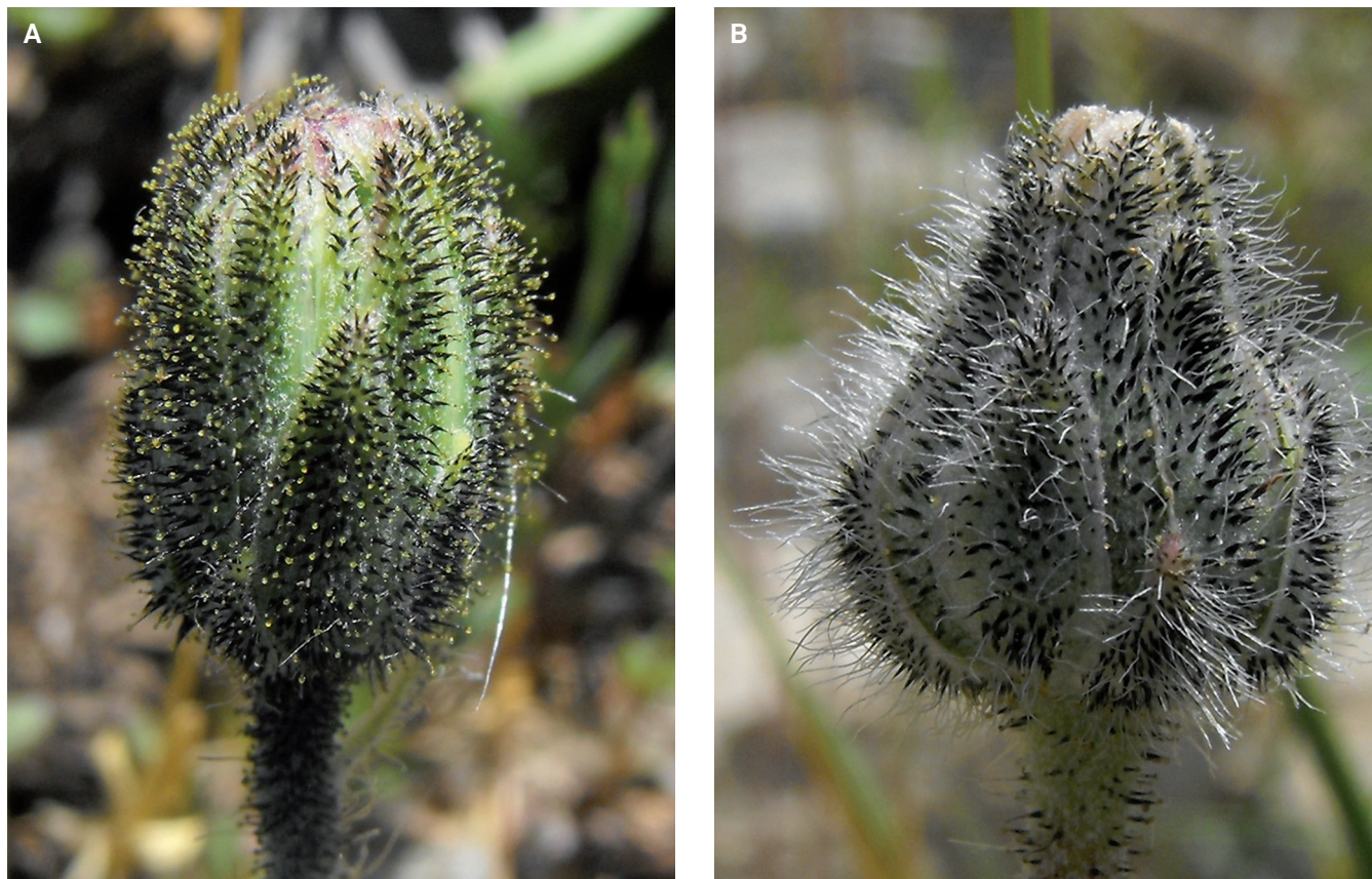
Fig. 3. – Details of the indumentum of the bracts. A. Pilosella hoppeana subsp. sicula Di Grist., Gottschl. & Raimondo; B. P. hoppeana subsp. macrantha (Ten.) S. Bräut. & Greuter.

Etymology. – The epithet “ sicula ” refers to the Sicily region, where the subspecies grows.