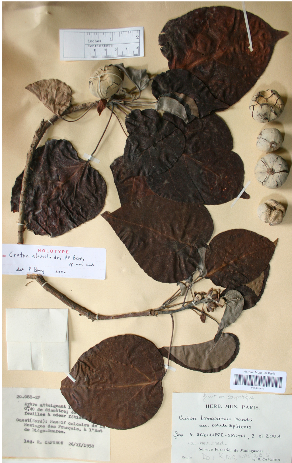
Fig. 1. – Holotype of Croton aleuritoides P.E. Berry. [Service Forestier 20088, P]