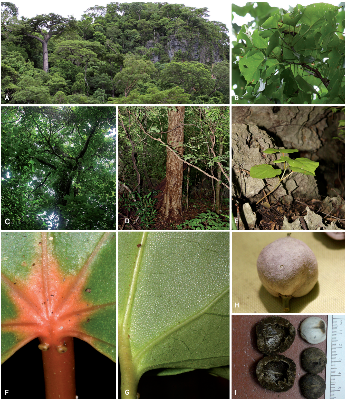
Fig. 3. – Croton aleuritoides P.E. Berry. A. Typical habitat in Montagne des Français, deciduous forest on limestone “tsingy”; B. Canopy leaves; C. Canopy from below; D. Trunk (c. 40 cm in diam.); E. Seedling growing in a crack of a block of limestone tsingy; F. Close-up of the adaxial side of a leaf base showing the epipetiolar glands and the distinct reddish coloration at the junction of the secondary veins; G. Close-up of the abaxial leaf surface showing the minute lepidote pubescence; H. Fruit, already fallen to the ground and still indehiscent; I. Endocarps and seeds; note the white fleshy cover of the fresh seed on the upper right.