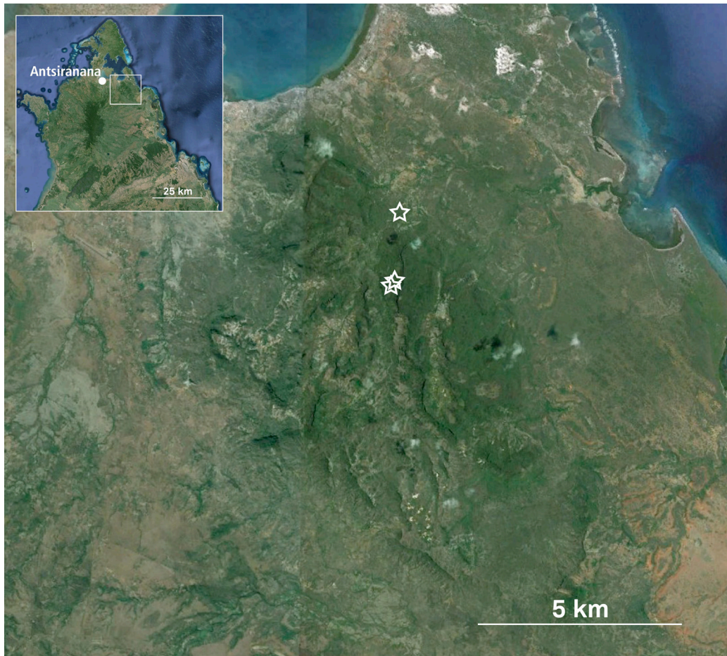
Fig. 4. – Distribution of known collections of Croton aleuritoides P.E. Berry from northern Madagascar, in the Montagne des Français massif (stars).

(names from SERVICE GÉOGRAPHIQUE DE MADAGASCAR, 1969). Along the Antso River in the flatter and less rocky part of the valley, there are many signs of cultivation or cutting of the forest, with remains of plantations or extensive spiny Lantana L. thickets. As one approaches the steeper sides of the valley below the cliffs that delimit it, there are remains of intact forest interspersed with areas that were clearly cut for some kind of plantation. Our local guide, who was part of the 2005 collecting trip, indicated that the area close to the spot where they collected C. aleuritoides had been recently cut at that time to grow Cannabis L. By the time we returned in 2016, there was no evidence of this cultivation, although the area that had been deforested was clearly discernable by its coverage with a single leguminous tree that had successfully colonized it within the last decade.