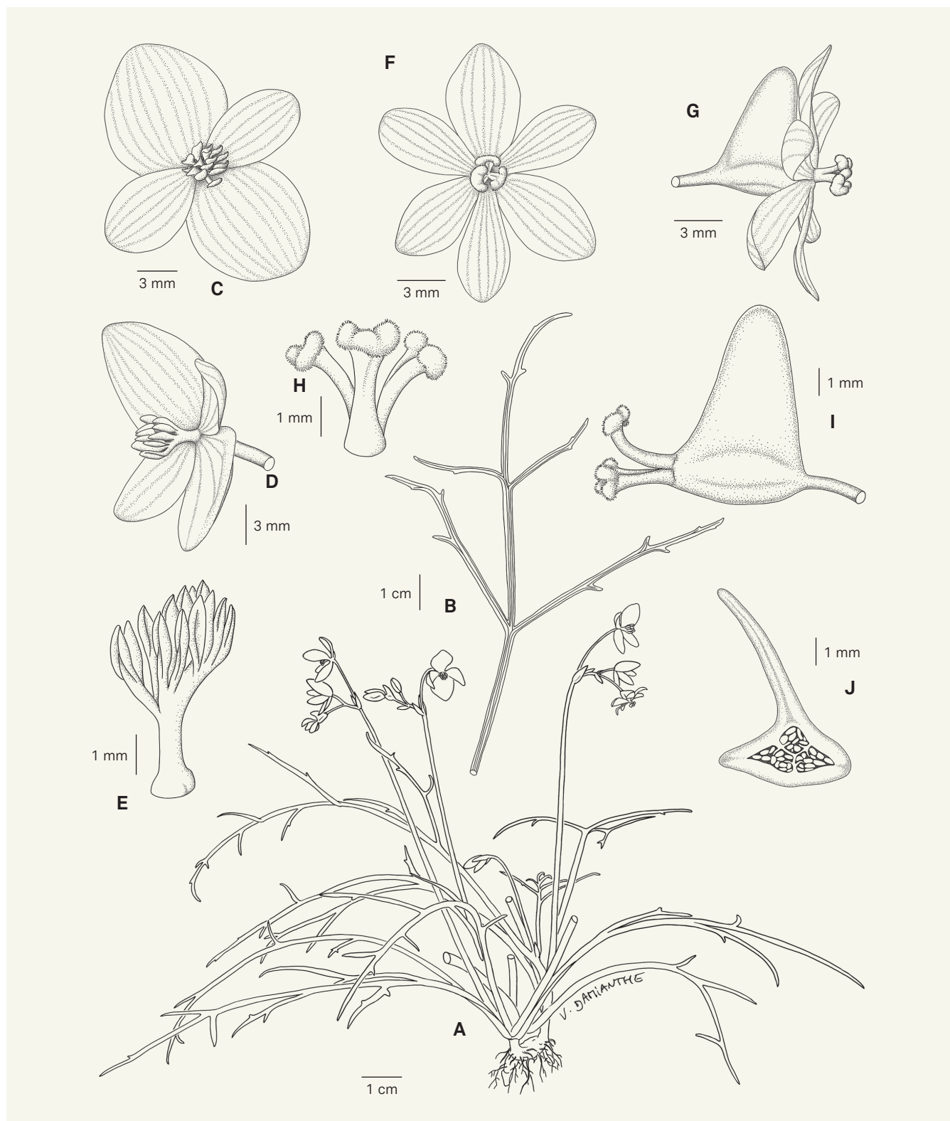
Fig. 2. – Begonia pteridoides Scherber. & Duruiss. A. Habit; B. Leaf, adaxial side; C. Male flower, front view; D. Male flower, side view; E. Androecium; F. Female flower, face view; G. Female flower, side view; H. Styles and stigmas; I. Ovary; J. Ovary cross-section. [Scherberich 1148, LYJB] [Drawing: Vanessa Damianthe]