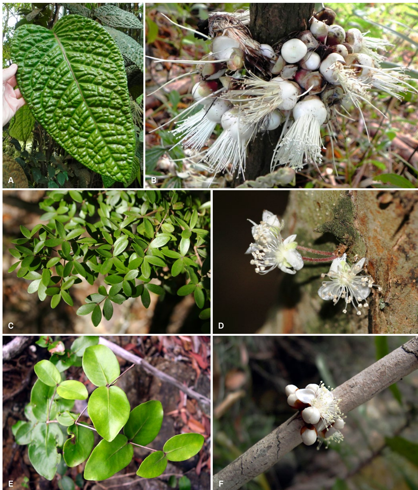
Fig. 1. – Eugenia bullata Pancher ex Guillaumin (Goro, Yaté, 30.VII.2011): A. Leaves; B. Inflorescence. Eugenia daenikeri Guillaumin: C. Leaves (presqu'île Porokoé, 28.I.2006); D. Flowers (presqu'île Koumourou, 13.XI.2006). Eugenia gacognei Montrouz. (Tontouta, 4.XI.2004); E. Leaves; F. Flowers.