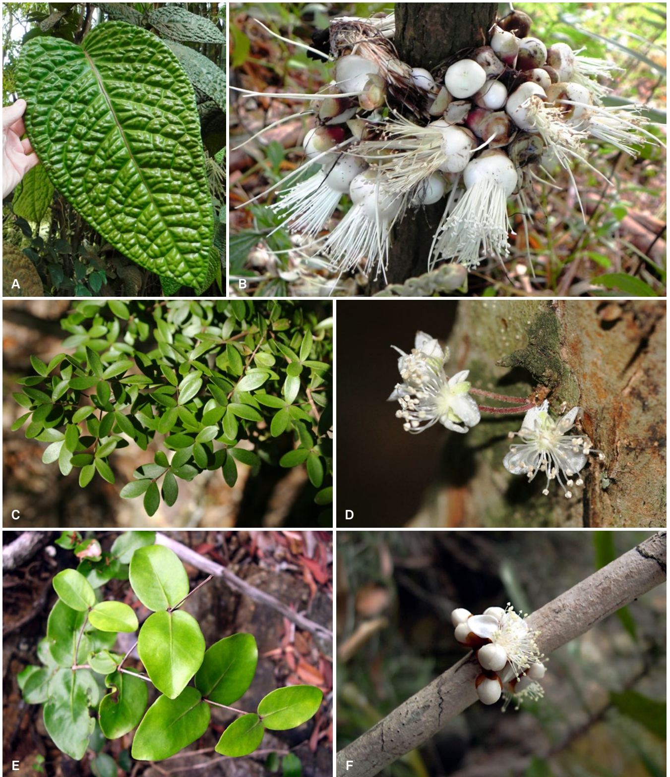
Fig. 1. – Eugenia bullata Pancher ex Guillaumin (Goro, Yaté, 30.VII.2011): A. Leaves; B. Inflorescence. Eugenia daenikeri Guillaumin: C. Leaves (presqu'île Porokoé, 28.I.2006); D. Flowers (presqu'île Koumourou, 13.XI.2006). Eugenia gacognei Montrouz. (Tontouta, 4.XI.2004); E. Leaves; F. Flowers.