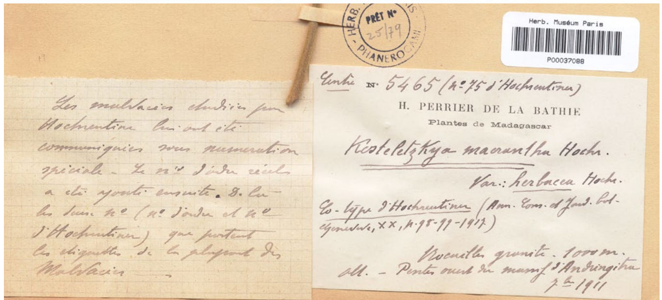
Fig. 1. – Label of the isotype of Kosteletzkya macrantha var. herbacea Hochr. at P with Perrier de la Bâthie's handwriting. [Perrier de la Bâthie 5465, P] [P00037088]

Vernacular name. – “Mainaty” ( Service Forestier 9422).