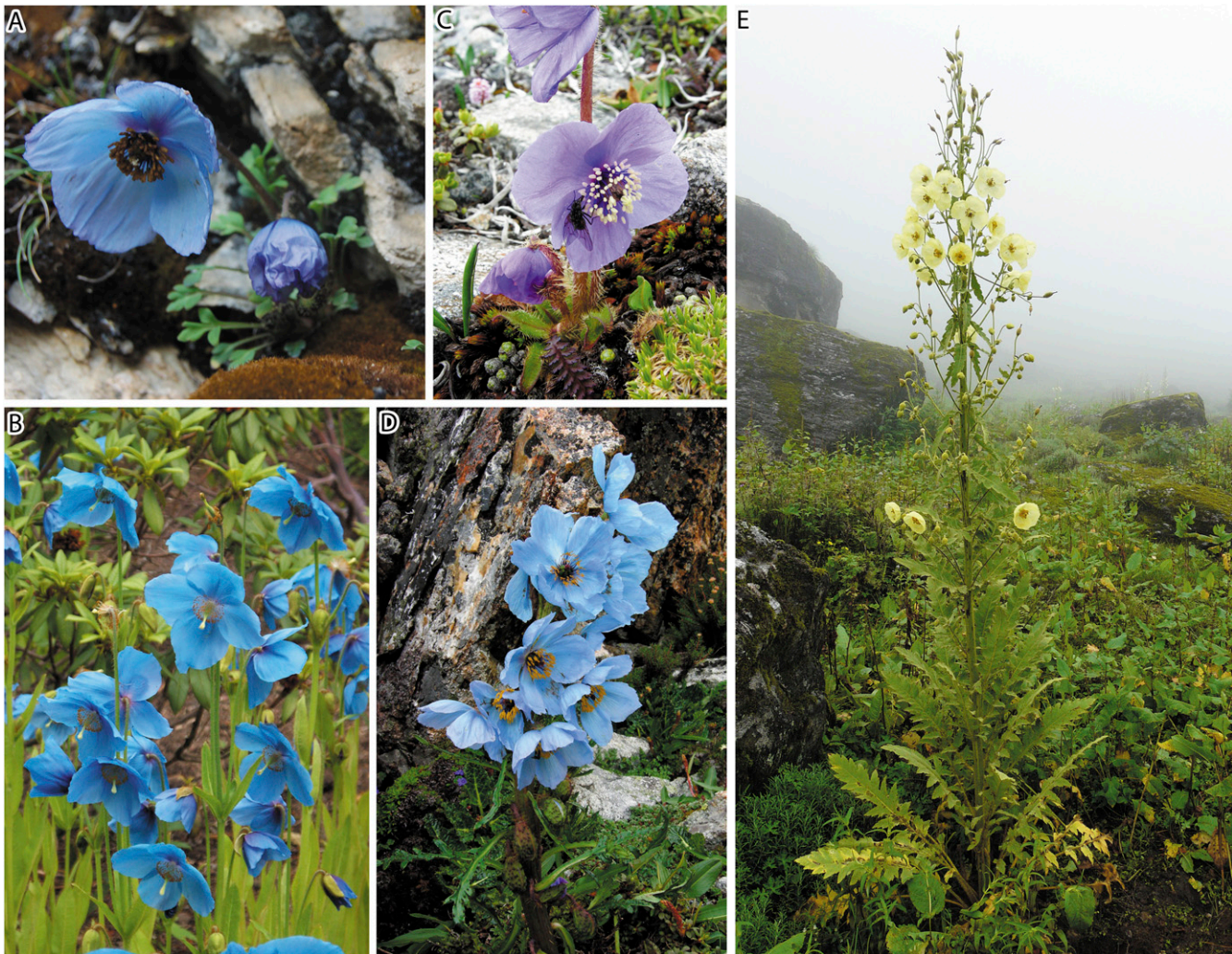
FIG. 2. Morphological overview of a species in each of the proposed Meconopsis sections. A. M. bella (in M. sect. Primulinae ). B. M. grandis cultivar (in M. sect. Grandes ). C. M. sp. (in M. sect. Aculeatae ) (possibly a hybrid between named species). D. M. speciosa (in M. sect. Aculeatae ). E. M. paniculata (in M. sect. Meconopsis ).

manually. Concatenated cpDNA data was analyzed using MrBayes v3.1.2 (Huelsenbeck and Ronquist 2005). Partition analysis was conducted for the combined cpDNA dataset with each cpDNA marker treated as a separate partition. The evolutionary models of nucleotide substitution were first selected by jModelTest (Posada 2008) under the Akaike information criterion (AIC), and we used the models most similar to the best fit models estimated by jModelTest and that were also available in MrBayes v3.1.2 for each gene partition: GTR+G for rbcl , GTR+I+G for ndhF , GTR+G for matK , and GTR+G for trnL-trnF dataset. Prior probability distributions on all parameters were set to the defaults. Twenty million generations were run using a Markov chain Monte Carlo method with four chains. Trees were collected every 100th generation. With 25% burn-in, a 50% majority-rule consensus tree was calculated to generate a posterior probability (PP) for each node.