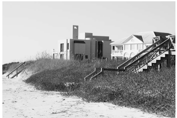
Figure 3. A beach vitex ( Vitex rotundifolia L.)-infested site (right) adjacent to an uninfested site (left) in fall. The delineation between the deciduous beach vitex (dark gray) and the sea oats ( Uniola paniculata L.) (light gray) is clearly visible.

Beach vitex is native to latitudes ranging from 0° to 38° (and potentially further north) (Lee et al. 2007). The range of beach vitex is restricted in that it is an obligate seashore shrub but expansive with regard to climatic tolerance. According to all BIOCLIM (Beaumont et al. 2005) statistics, except those associated with the seasonality of precipitation, the climate at the highest latitude from which the authors have found plant samples (Korea) is similar in many ways to the climate associated with areas near the Connecticut–New York border. The Korean site and the Connecticut–New York border record annual mean temperatures of 11.7 and 11 C, (53 and 52 F), annual precipitation of 1,196 and 1,183 mm, maximum temperature in the warmest month of 27.6 and 28.7 C, and minimum temperatures in the coldest month of –5.9 and –6 C, respectively (WorldClim 2009). It is logical to assume that the maximal extent of beach vitex in the United States should be climatically equivalent to the extent of beach vitex in the Pacific. Under these assumptions, beach vitex is likely capable of growing in Connecticut, Delaware, New Jersey, and New York. Our predictions are limited by the published accounts of beach vitex sightings. Beach vitex may exist at higher latitudes