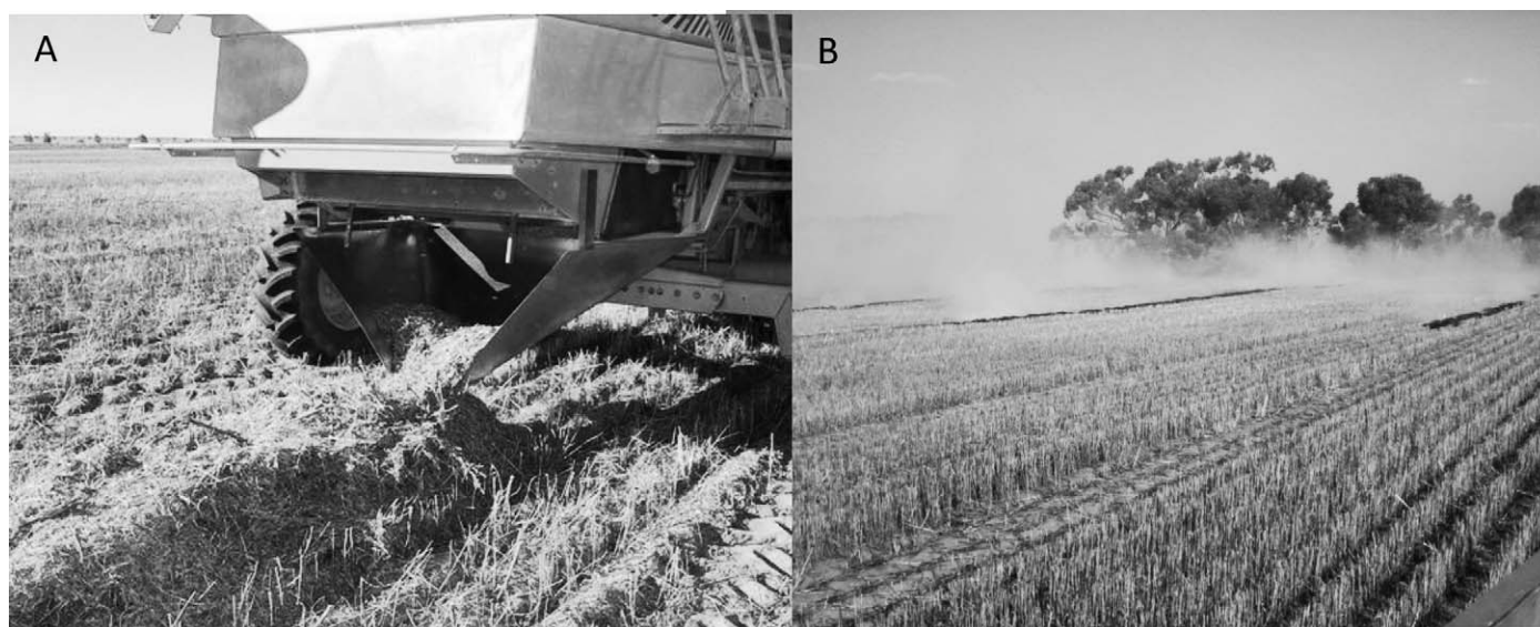
Figure 2 a) Chaff chute mounted on the rear of a harvester to form narrow windrows during harvest. b) Burning narrow windrows in wheat stubble in autumn (March to April)

Smith 1975). The biological attribute of seed retention at maturity in annual ryegrass, wild radish, and several other annual crop weed species, means that seeds are attached to the upright plant enabling the weed seeds to be collected (harvested) during grain crop harvest. For example, in field crops a large proportion (up to 80%) of total annual ryegrass seed production can be collected during a typical commercial grain harvest (Walsh and Powles 2007). These weed seeds enter the front of the grain harvester, are processed, and exit the grain harvester in the chaff fraction. An irony is that these “harvested” weed seeds are evenly redistributed across the crop field to become future weed problems. Thus, grain crop harvest presents an opportunity to target weed seed production, thereby minimizing replenishment/increase of the weed seedbank. As outlined below, harvest weed seed control (HWSC) systems have been developed in Australia to target and destroy weed seeds during commercial grain crop harvest, minimizing weed seed inputs into the seedbank (Walsh and Powles 2007).