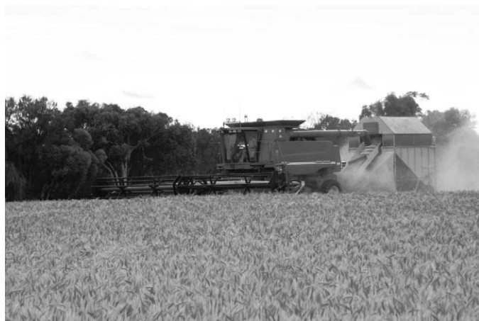
Figure 1. Chaff cart system in operation during commercial wheat crop harvest.

how a major herbicide-resistant weed problem has been the catalyst for the development of new non-chemical weed control techniques focused on weed seed capture and destruction during commercial grain crop harvest. We illustrate how the inclusion of these techniques in weed control programs allows weed populations to be driven to and maintained at very low levels. Finally, we speculate on the potential for at-harvest weed seed targeting technologies in global field crops.