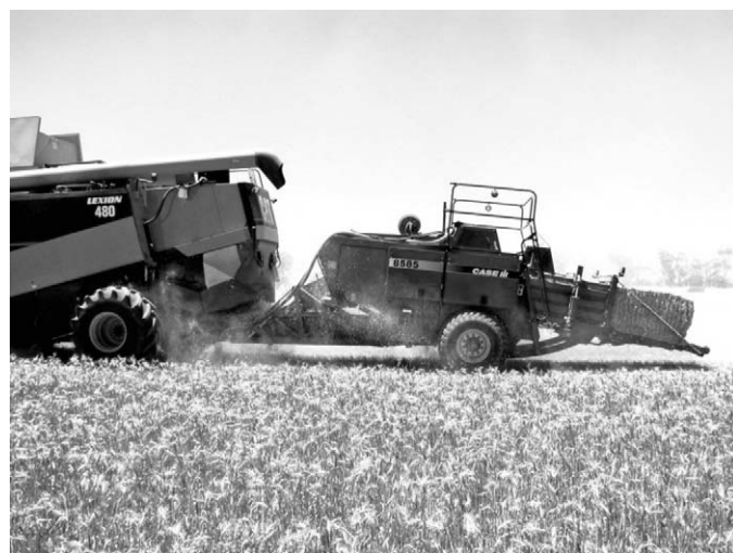
Figure 3. Bale direct system collecting and baling chaff and straw residues during wheat harvest.

the weed seeds present from returning to the cropping field. The large volume of collected chaff is typically dumped in chaff heaps in lines across fields in preparation for subsequent burning to achieve weed seed destruction. Alternatively, chaff material is a valuable livestock feed source and can be grazed in-situ or, in some instances, collected for use in feed-lots. This necessity for post-harvest management of chaff material has limited the Australian adoption of chaff cart collection systems despite their recognized efficacy in the management of major herbicide-resistant weed problems. However, the weed seed targeting efficacy of chaff cart collection systems (Walsh and Powles 2007) maintained the continuing interest in the development of additional HWSC systems.