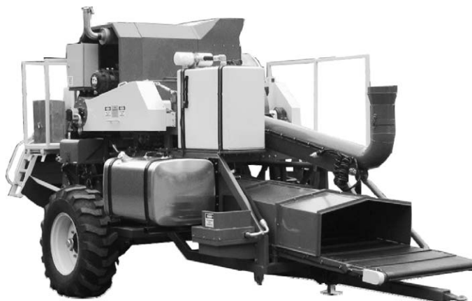
Figure 4. First commercially available Harrington Seed Destructor

Narrow windrow burning. The simple but effective narrow windrow burning system is currently the most widely adopted HWSC system in Australia. This inexpensive system uses a grain harvester mounted chute to concentrate all of the exiting chaff and straw residues into a narrow-windrow (500 to 600mm) (Figure 2a). These narrow windrows are subsequently carefully burnt under the right environmental conditions, avoiding burning the entire crop field (Figure 2b). The concentration of chaff and straw residues increases the duration and temperature of burning, creating the highest potential for weed seed destruction. Weed seed kill levels of 99% for both annual ryegrass and wild radish have been recorded from the narrow-windrow burning of wheat, canola, and lupin ( Lupinus angustifolius L.) chaff and straw residues (Table 1, Walsh and Newman 2007). The simplicity and low cost of this narrow-windrow system has resulted in its adoption by an estimated 70% of crop producers in the major grain production state of Western Australia.