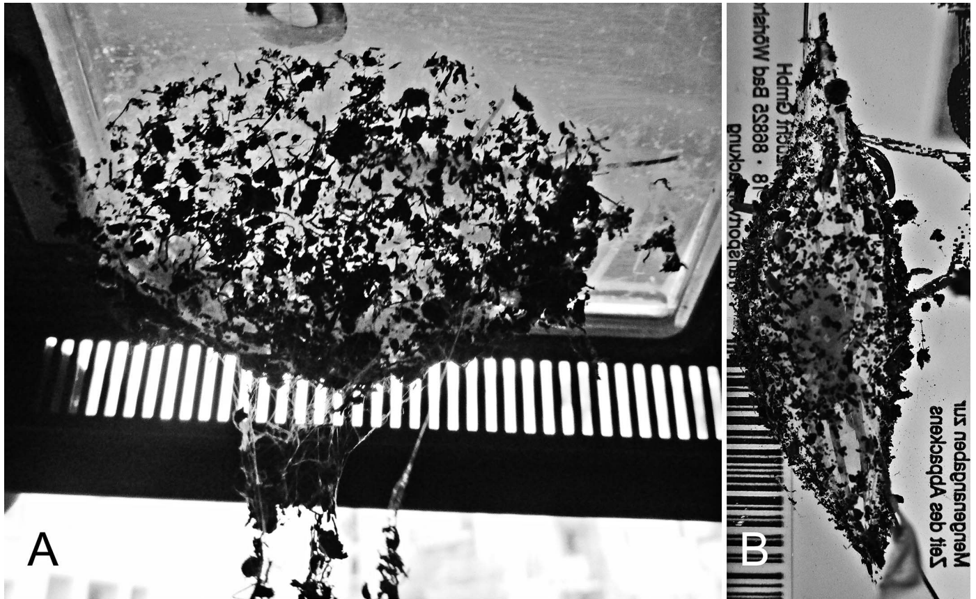
Figure 2.—Inhabited silken retreats of Viridasivus sp. from below, built in captivity. (A) subadult male kept on potting soil, (B) juvenile (body length ~13 mm) kept on coco humus and sand

Brescovit 2000, Zimmermann & Spence 1992). Ctenus medius Keyserling, 1891 was found during the day sitting under rocks and tree trunks, while wandering around at night (Almeida et al. 2000), similar to Phoneutria boliviensis (F. O. Pickard-Cambridge, 1897) (Hazzi 2014). Therefore, the herein described silken retreats of Viridasivus sp. are more similar to those found in several dionychan spider families, and corroborate the classification of Viridasiidae as members of the Dionycha (Polotow et al. 2015, Wheeler et al. 2017).