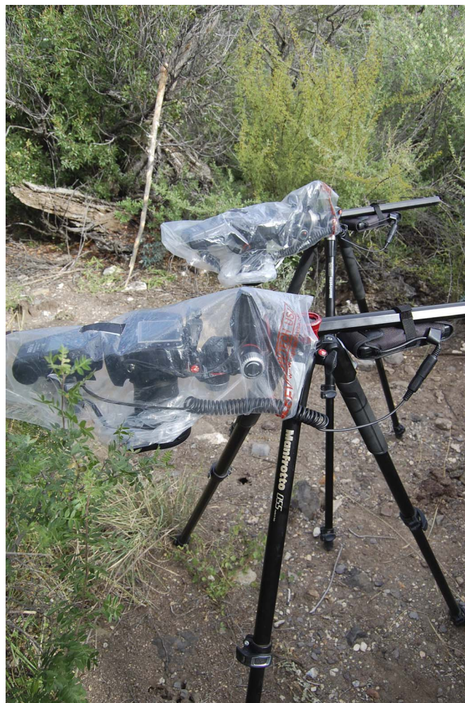
Figure 2.—Camera set-up over nests of Novomessor albisetosus ; field of view includes main nest entrances as well as an extensive area surrounding the nest entrance (approximately 0.152 m 2 covered by each camera).

The similarity in color, size, and eye reflectance of the spider photographed October 12 th and M. chihuahuensis (compare Fig. 3 with Fig. 4) is compelling. The adjacency of the photographed spider with ants, particularly dead ants, also strongly suggests this to be M. chihuahuensis . The fact that the spider never left the vicinity of the nest entrance; was not photographed away from the entrance, despite five nights of filming and nearly 4000 images surveyed; was