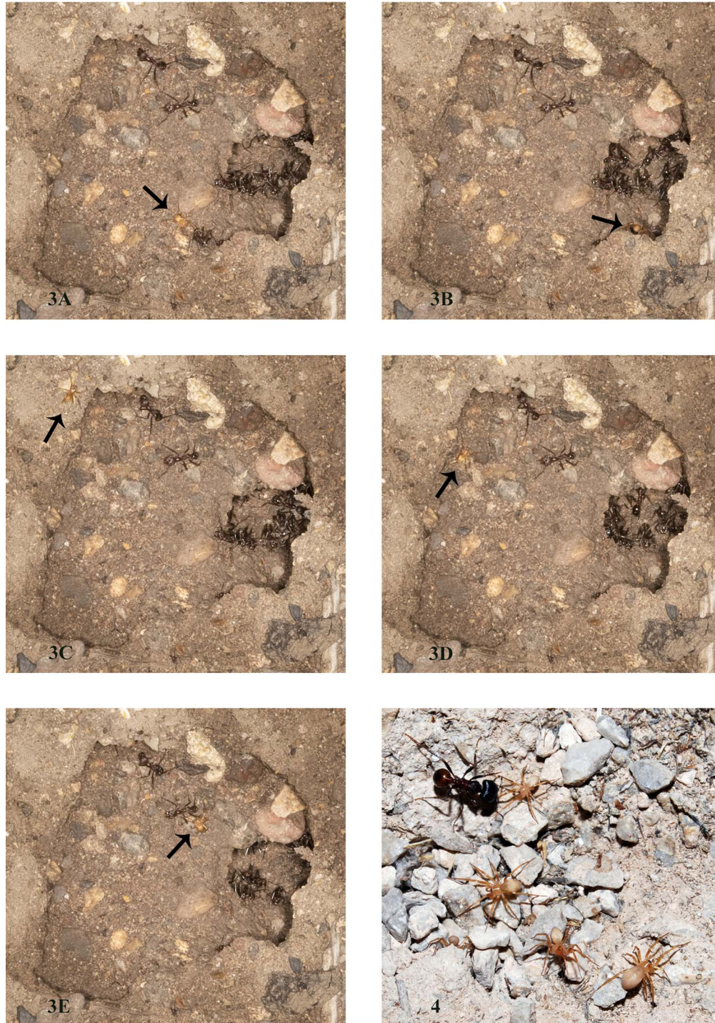
Figures 3–4.—Images of Myrmecicultor chihuahuensis in the direct vicinity of the nest entrance of a Novomessor albisetosus nest on October 12, 2022. (A) Spider approaching a dead ant; (B) Spider entering the nest entrance; (C) Spider at the lip of the entrance; (D) Spider inside the depression of the nest entrance; (E) Spider next to another dead ant in the depression of the nest entrance. Arrows point to the location of the spider; (4) Nest of Pogonomyrmex rugosus in the Chihuahuan Desert in Mexico with Myrmecicultor chihuahuensis on the surface with the ants.

seen entering the nest; had been collected previously from the nest excavation pits; and has a CHC profile similar to species of Novomessor suggests that this spider is a myrmecophile as well as a myrmecophage, spending some or all of its life cycle inside the nest chambers of the ant nest. The observations by David Lightfoot of