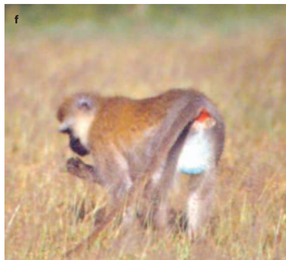
Figure 1. Striking examples of mammalian coloration: (a) striped skunk (photograph: © 1989 Jeff Wilcox, used with permission), (b) Burchell's zebra (photograph: Tim Caro), (c) ermine (photograph from the collection of the Museum of Wildlife and Fish Biology, University of California–Davis, used with permission), (d) tiger (photograph: Tim Caro), (e) beisa oryx (photograph: Tim Caro), and (f) vervet monkey (photograph: © 1987 Lynne Isbell, used with permission).