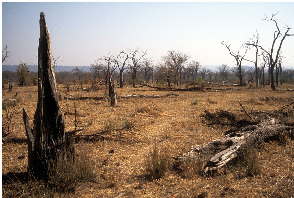
These mopane trees were killed by foraging elephants in Hwange National Park, Zimbabwe. Elephants are powerful ecosystem engineers, capable of transforming woodlands into savanna or shrubland.