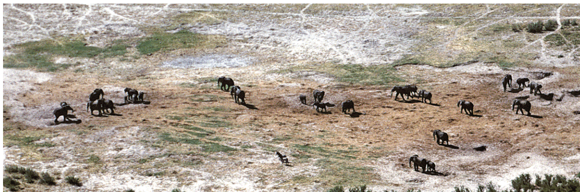
An aerial photo shows a group of elephants at Shakwanki seep in Zimbabwe's Hwange National Park, during a time of drought. The many obvious elephant trails make the animals easy to track. Such trails may have made mammoths and mastodons easy prey for late-Pleistocene human hunters.