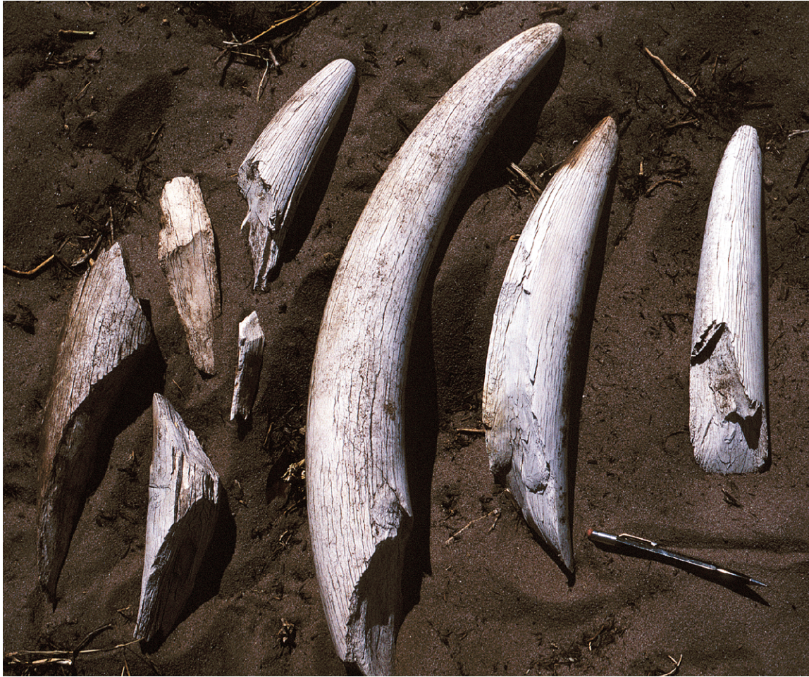
These tusk fragments are from Shabi Shabi seep, Hwange National Park, Zimbabwe. The ivory tips broke off as elephants used their tusks to jostle each other in a struggle for access to a tiny water supply during a drought. These tusk pieces are very similar in size and shape to fossil mammoth and mastodon tusk specimens often mistakenly interpreted as made by human hands.

adding new layers of dentin. Like the growth rings of a tree trunk, the width of dentin layers reflects easy or hard times. When animals are in good condition, they add more tusk material in a given length of time; when they're stressed by shortages of food, the dentin increments get thinner.