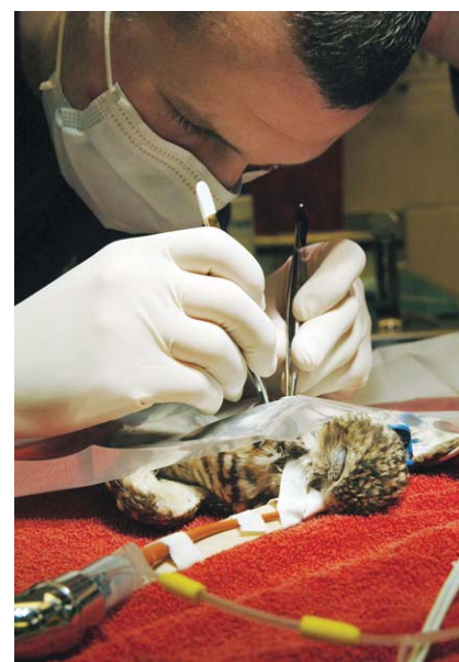
A St. Louis Zoo veterinarian performs a liver biopsy on an owl. ZIMS will help zoos share information about treating animals and tracking diseases that could spread not only from animal species to animal species but also from wildlife to humans.