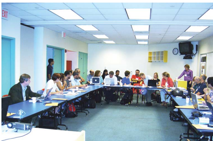
Members of the international zoo and aquarium community confer at a ZIMS design workshop. Workshop participants discussed the needs a new system would have to address, the kinds of data it would manage, and how it should be designed and implemented.