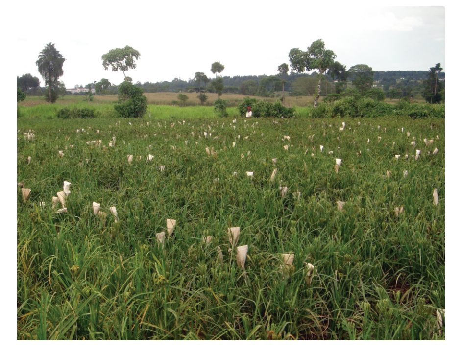
In these test plots at the Kenya Agricultural Research Institute, Chrispus Oduori Adeti is breeding for higher yield and resistance to the fungal disease neck blast. Finger millet is an important food crop because of its long-term storage capacity and its high nutritive value, making it important in the diets of children and expectant and breastfeeding mothers.

gen populations." Currently, he says, "work is at the phase of conducting field trials for the lines [246 in number] we have so far established from our various breeding crosses using the conventional breeding methods. We are conducting participatory, variety selection trials with the farmers so as to address the farmer requirements, and at the same time evaluating the lines for the various biotic and abiotic stresses."