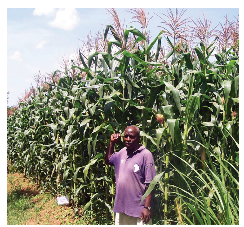
A farmer stands in his maize field near the town of Bungoma, in western Kenya. The hybrid white maize growing in this field produces about three times the average yield. It is most commonly used for porridge. Maize and cassava are the two most important crops in Africa, with the highest maize consumption in eastern and southern Africa.

Another breeder, Chrispus Oduori Adeti, focuses on finger millet in western