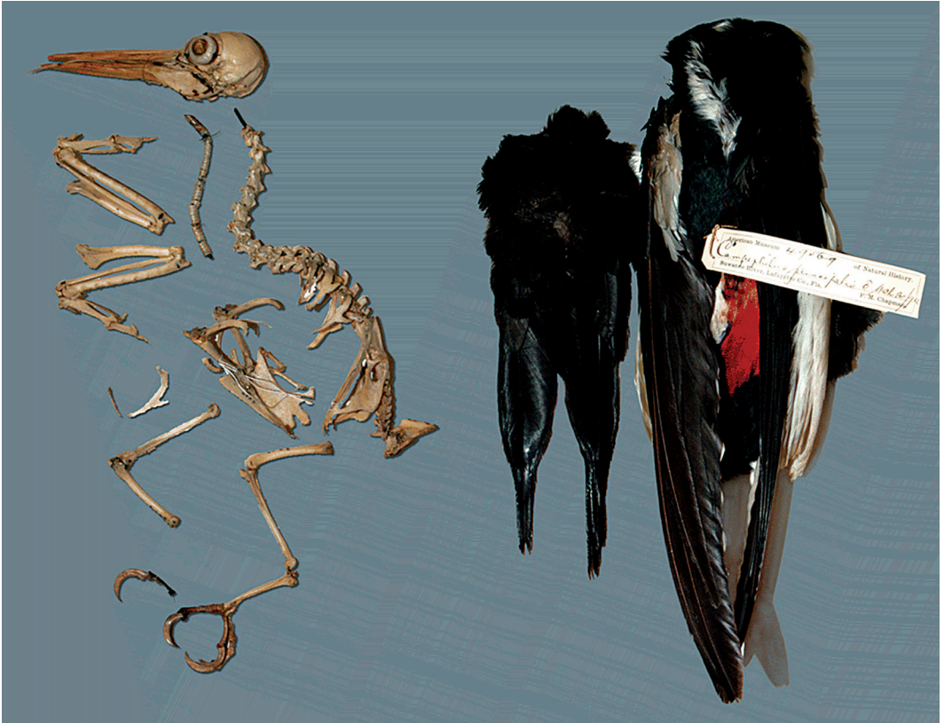
FIG. 2. Skeleton (AMNH 4708) and flat, folded dry pelt (AMNH 49569) of male Ivory-billed Woodpecker collected by Frank M. Chapman in Florida on 24 March 1890. Notice detached tail.

pattern, also allows for comparative study among members of Picidae, such as the sympatric Pileated Woodpecker ( Dryocopus pileatus ; Fig. 4).