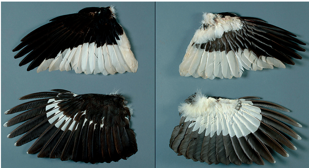
FIG. 4. Dorsal (left) and ventral (right) surfaces of left wing of male Ivory-billed Woodpecker (above) and Pileated Woodpecker (below).