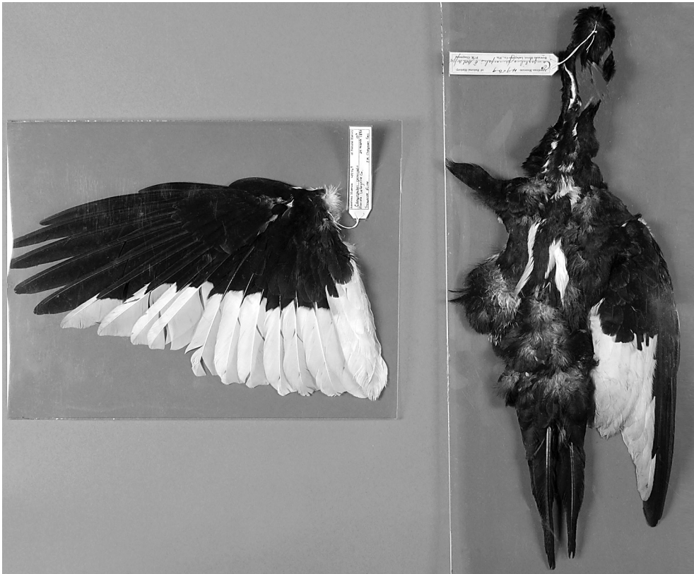
FIG. 3. Detached, extended wing and relaxed pelt of Chapman's Ivory-billed Woodpecker specimen in protective Mylar envelopes. Notice reattached tail.