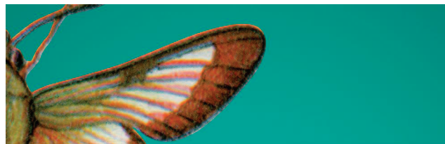
Insects, Pterosaurs, Birds, Bats and the Evolution of Animal Flight

own type of flight muscle, whose contraction frequency is not limited by the mechanics of the wings that they flap. Insect flight muscles produce rather little power but work well at frequencies higher than those of vertebrates, into