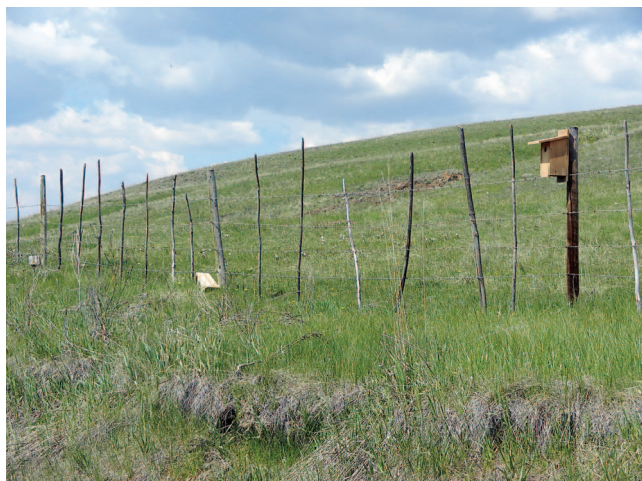
FIGURE 1. Experiment 3 set-up in open grassland habitat near Riske Creek, British Columbia. Two previously active nest boxes on adjacent fence poles owned by a Tree Swallow pair and a Mountain Bluebird pair were removed and placed on the ground, and a single, new, unowned box was erected on a new adjacent fence pole in the right foreground for the pairs to compete over.

box by separating box dyads by at least 400 m. This distance is larger than the size of a Mountain Bluebird territory, so that all individuals would suffer a cost of giving up their territory and moving to defend a new, unfamiliar area if they did not keep a box. No other natural cavities were available within the 400 m because the habitat was open grassland. By checking the boxes about every 2–3 days, I was able to track settlement of birds and appearance of nest materials.