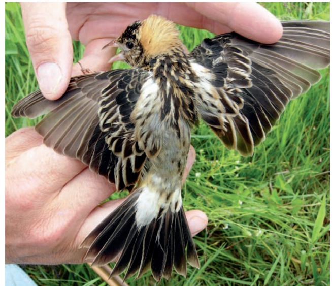
FIGURE 1. A female Bobolink in male-like plumage (Perlut 2008; used with permission).

Bergtold had another interesting note (33:439) about “pseudo-masculinity” in the Spotted Towhee ( Pipilo maculatus ). He had collected what he thought was a male of the species, although with light colors, but upon preparing the specimen it turned out to be a female with perfectly functioning ovaries. The literature on this phenomenon at the time (e.g., Bland Sutton 1890) suggested that the ovaries should be diseased or damaged