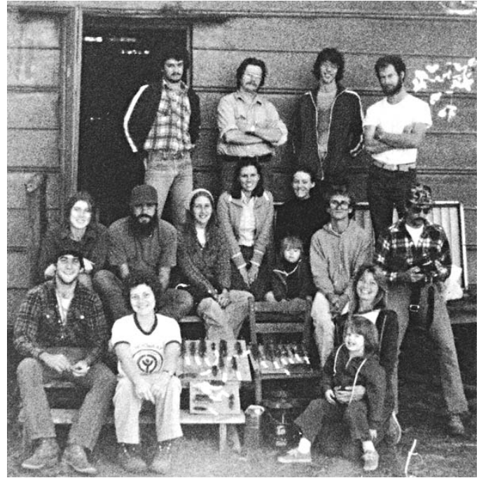
FIG. 2. —My 1st mammalogy class at Louisiana State University in 1979. At least 3 students in this class became professional field biologists, and there may have been others.

The increasing number and complexity of regulations. —Bureaucratic regulations, including foreign, federal, state, and local research permits; permits for collection, importation,