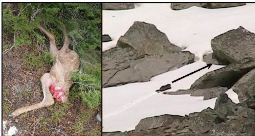
FIG. 3. —This elk calf was killed by a female wolverine ( Gulo gulo ) on 16 June 2004 in southwestern Montana. She had moved parts of the carcass to a rendezvous site where she had a cub. She dragged the remainder of the carcass to another cache site under large boulders (right photo) where there was ice that was likely to be present until autumn. Structure and cold temperatures may be critical habitat features for cache longevity because they inhibit competition from avian, mammalian (e.g., bears), insect, and bacterial competitors.

of the timing of reproductive events, summer foods appear to have an equally important role, and the limited information specific to summer diet indicates that predation on small prey occurs frequently in most areas (Gardner 1985; Lofroth et al. 2007; Magoun 1987; Packila et al. 2007). Total biomass obtained from small prey can be significant; 1 female was observed to eat 2 small mammals or ptarmigan chicks, an adult ptarmigan, a ground squirrel, and 2 eggs during a 2½-h period in June (Magoun 1987). In addition, wolverines have been documented as the main predator of woodland caribou calves during the calving season (Gustine et al. 2006), and predation on reindeer and other ungulate neonates occurs (Björvall et al.