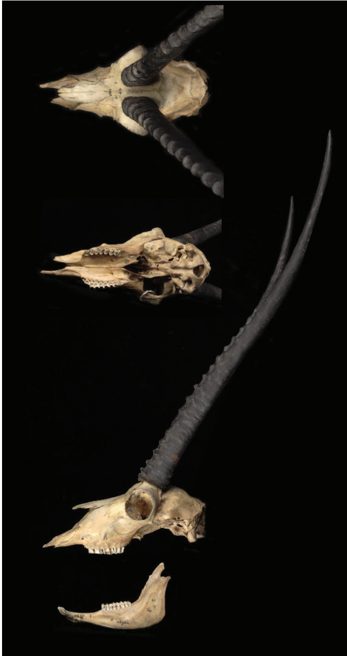
Fig. 2. —Dorsal, ventral, and lateral views of skull and lateral view of mandible of adult male Pantholops hodgsonii (British Museum [Natural History], specimen 1843.112.100). Greatest length of skull is 256 mm, but note that the tip of nasals is broken off.