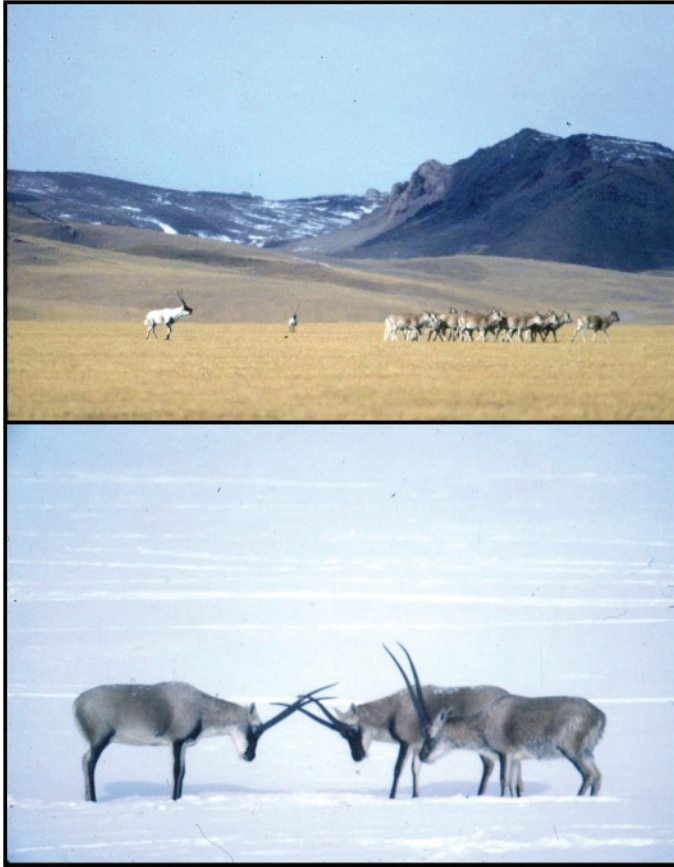
Fig. 6. —Mature male Pantholops hodgsonii tending a harem in December with a typical Tibetan backdrop (top), and mature males sparring, Qinghai, late October (bottom).

Among 1,000 male P. hodgsonii dispersed in the Aru Basin of the Chang Tang Nature Reserve in summer 1992, mean group size was 6.6 individuals (range: 1–82 individuals, 50% of groups 2–20 individuals); during autumn and spring migration, female herds can exceed 1,000 individuals, but they disperse into small groups of generally \leq 20 individuals, with as many as 15–20% of females occurring singly (Schaller 1998). Yearling males begin to leave their mothers at 10–11 months of age and associate more regularly with males of their own age or older (Schaller 1998).