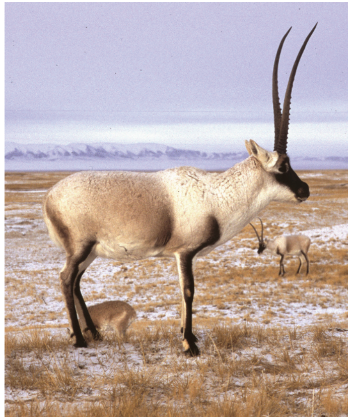
Fig. 1. —Mature male Pantholops hodgsonii in nuptial pelage, Qinghai Province, China, November 2006.

CONTEXT AND CONTENT. Order Artiodactyla, suborder Ruminantia, family Bovidae, subfamily Caprinae, tribe variously Pantholopini or Saigini. Pantholops is monotypic. Hodgson (1834) aligned P. hodgsonii with the “Antilopine” and “Gazelline” groups, but Gray (1872) created a new family, Pantholopidae, because of its “peculiarities” (Pocock 1910:899). Current molecular and morphological studies align P. hodgsonii most closely with Caprinae (e.g., Gatsey et al. 1997; Gentry 1992), although some contend that additional genetic resolution needs to be achieved (Lei et al. 2003; Schaller and Amato 1998). Based on behavior and various morphological characteristics, Vrba and Schaller (2000:220) concluded that Pantholops “has no close recent relatives and represents an ancient lineage that diverged during the Miocene from the closest living forms [Caprinae].” Grubb (2005) placed P. hodgsonii in the subfamily Caprinae.