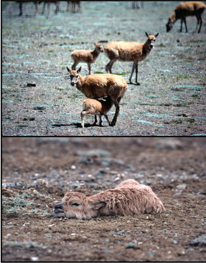
Fig. 4. —One-month-old Pantholops hodgsonii suckling in early August (top), and a newborn calf laying in open steppe habitat in late July (bottom), Tibet.

status of P. hodgsonii , cloning has been investigated using goat and rabbit oocytes, with some blastocyst development noted (Zhao et al. 2006, 2007).