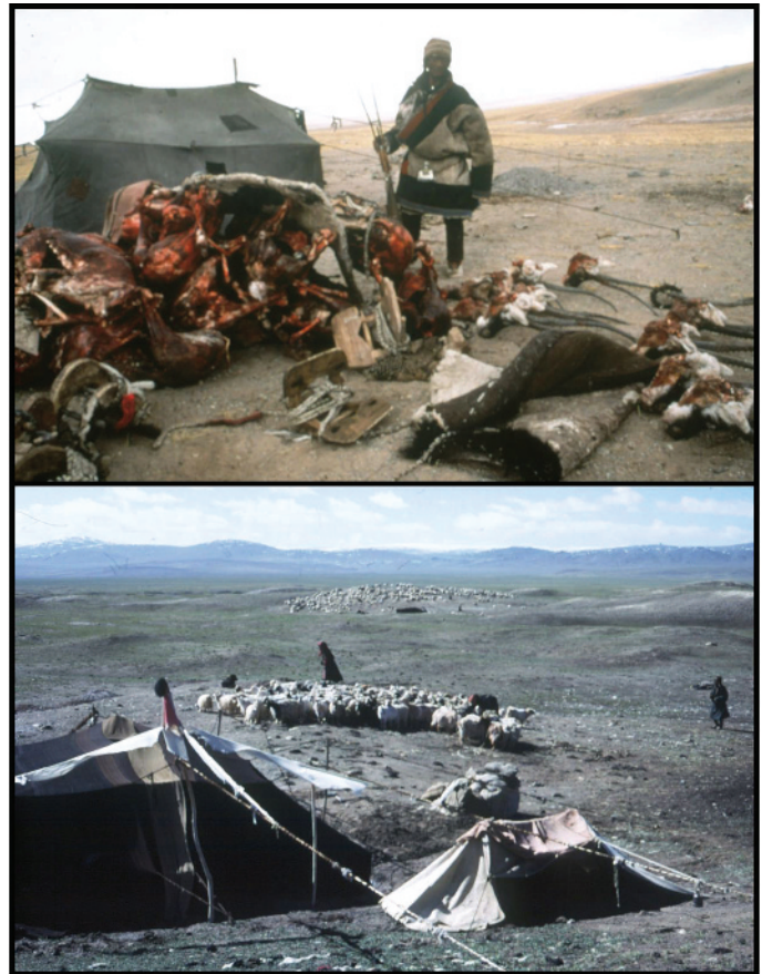
Fig. 7. —Poacher's camp with a pile of carcasses and heads of Pantholops hodgsonii in Tibet, December (top), and nomad tents and herds of sheep and goats occupy traditional range of P. hodgsonii in western Tibet, July (bottom).

Based on lithic assemblages with specialized blade technology from the northern Chang Tang (Schaller 1998), humans probably have occupied the Tibetan Plateau since the late Pleistocene–early Holocene 15,000–25,000 years ago (Brantingham et al. 2001). Given sparse resources for subsistence on the Plateau, humans have been dependent on hunting ungulates to varying degrees since initial occupation (Ekvall 1968; Huber 2005). Traditional hunting techniques for P. hodgsonii vary by season (Huber 2005) and