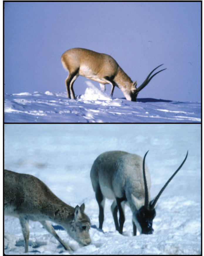
Fig. 5. —Adult male Pantholops hodgsonii pawing for scant forage (top), and adult male and female foraging in snow (bottom), Qinghai, late October.

Diets. — Pantholops hodgsonii is an herbivorous ruminant. Foraging preferences are understood mainly from limited microhistological analyses of feces (Cao et al. 2008; Harris and Miller 1995; Schaller 1998). P. hodgsonii is a mixed feeder (Cao et al. 2008), seasonally eating grasses, sedges, forbs, and select parts of dwarf woody vegetation, although dietary diversity is constrained substantially by limited forage availability and diversity on the Tibetan Plateau (Schaller 1998). In Chang Tang Nature Reserve, annual percent use of various plants is graminoids: Stipa , 3.7–47.3%; Kobresia , 1.1–33.1%; Carex moorcroftii , 0.5–22.8%; herbaceous plants: Potentilla bifurca , 0.3–31.1%, Leontopodium , 0.2–11.9%; and dwarf shrubs: Ceratoides compacta , 0.2–63.5%, Ajania fruticulosa , 21.2% (Schaller 1998).