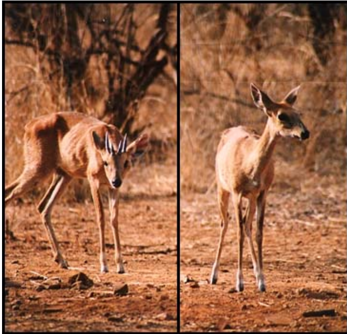
Fig. 5. —Male (left) and female (right) Tetracerus quadricornis associate irregularly and are seen together most often during rut in May–July, Panna National Park, central India.