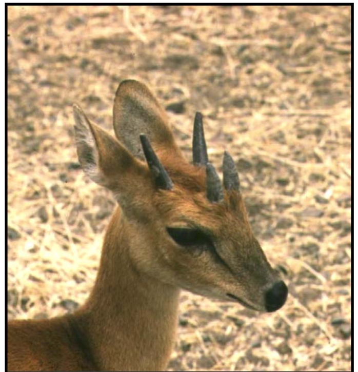
Fig. 1. —Male Tetracerus quadricornis illustrating the 4 horns typical of adult males of 2 subspecies; note enlarged preorbital gland extending below the eye.

CONTEXT AND CONTENT. Order Artiodactyla, suborder Ruminantia, family Bovidae, subfamily Bovinae, tribe Boselaphini. Tetracerus is monotypic.