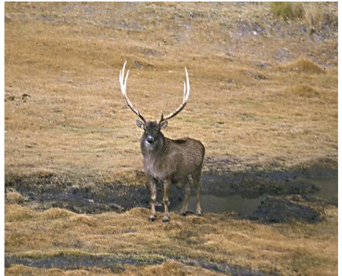
Fig. 5. —Male Przewalskium albirostre standing near a muddy wallow in Qilian Mountains, northeastern Qinghai; mature males seek out such wet wallows, a behavior that departs from some other large deer species.

Yu et al. (1993) provided the following details on behavior of female P. albirostre during parturition. Females separate themselves from other females and seek secluded places to give birth and hide their neonates. Among 37 birthing sites in Sichuan, 46% occurred in Rhododendron