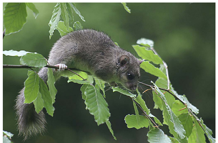
Fig. 1.—Adult Glis glis from Mt. Kočevski Rog, Slovenia.

Glis italicus Barrett-Hamilton, 1898:424. Type locality “Siena,” Italy.