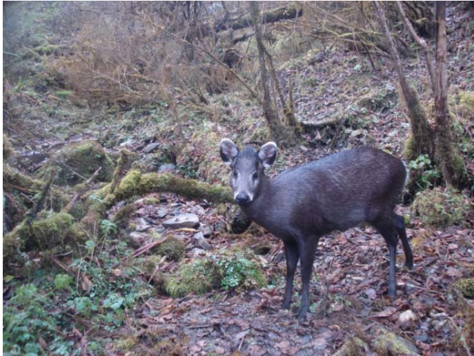
Fig. 5. —Typical forested habitats of Elaphodus cephalophus in southern China tend to have open understories but often with abundant shrubs (not obvious here) and herbaceous vegetation for cover and food. Photograph taken during the camera-trap surveys of Li et al. (2012) in Sichuan, Gansu, and Shaanxi provinces, China, and freely available at Smithsonian Wild ( www.siwild.si.edu ).

Shaanxi (Zeng et al. 2007), and Tangjiahe Reserve, Sichuan, where they were found significantly disjunct from human settlements (Wang et al. 2006).