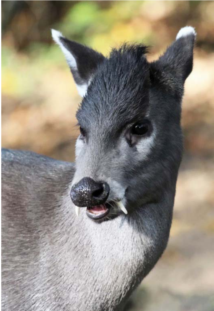
Fig. 6. —Developed upper canine teeth, tufts on hair on the top of the head, and white-tipped ears are characteristic of male (pictured here) and female Elaphodus cephalophus ; only males have antlers, but they are typically obscured by the crown tuft and perhaps rarely shed (unlike annually shedding of antlers by other species of Cervidae). Photograph taken at the Zoologischer Garten Magdeburg, Germany, by Николай Усик ( http://paradoxusik.livejournal.com ), available under the Creative Commons Attribution–Share Alike ( http://en.wikipedia.org/wiki ).

agile and flees with “catlike jumps,” with its tail upright and wagging, exposing the white underside (Geist 1998:47)