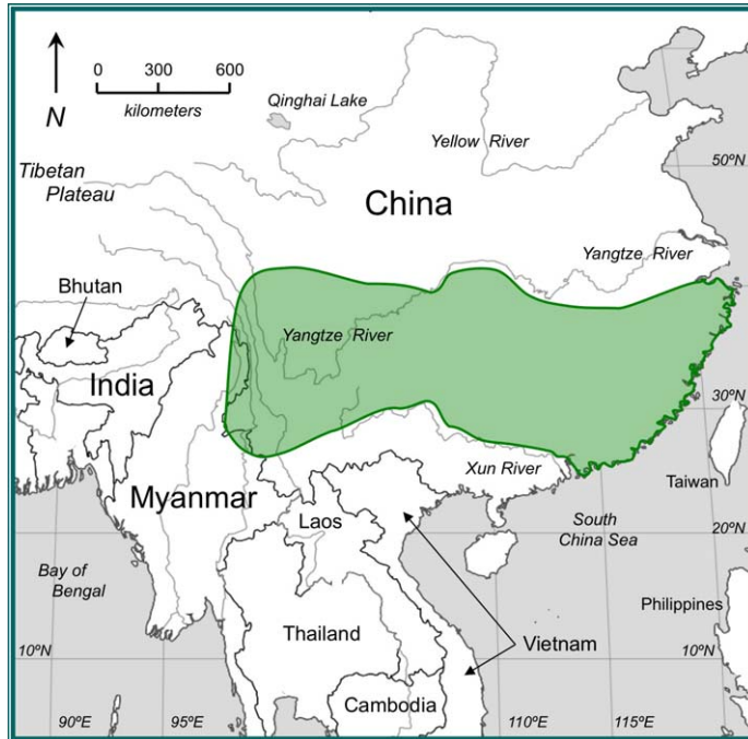
Fig. 2. —Distribution of Elaphodus cephalophus in a large area of southern China from the eastern reaches of the Tibetan Plateau to the southwestern coastal mountains and northwestern Myanmar; occurrence in Myanmar is based on historical records because no recent observations of E. cephalophus have been made there (base map from Brigham Young University's Geography Department, https://geography.byu.edu/pages/resources/outlineMaps.aspx ).