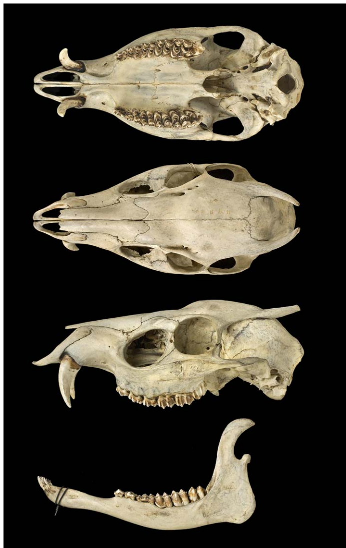
Fig. 3. —Ventral, dorsal, and lateral views of skull and lateral view of mandible of an adult male Elaphodus cephalophus (The Natural History Museum, London, specimen 11.9.8.44); upper canines, particularly large preorbital openings, and reduced and convergent antler pedicels (on males only) are characteristic. Greatest length of skull is 196.0 mm.