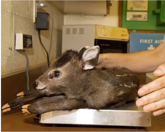
Fig. 4. —Weighing a neonatal Elaphodus cephalophus at Front Royal (Virginia), Smithsonian Conservation Biology Institute, National Zoological Park; note light tan-brown hooves of the neonate that blacken with age and characteristic midline spots that fade with age.

divided by the diameter of the hair shaft) of guard hairs from E. cephalophus was comparable to that of other Chinese cervids that inhabit cold climates (Sheng et al. 1993).